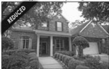
WATERFORK PARK | 15314 Beecham Dr. $290,000 / MLS# 39505384 / 3760 SqFt 4/5 Beds + 4 full baths / Immaculate & versatile home / High ceilings / Private backyand