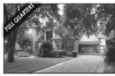
NORTHGATE FOREST | 3007 Pine Lake Trail $635,000 / MLS# 75359448 / 5918 SaFt 5 bedroom custom plus full guest quarters / pool & spa open concept / huge kitchen with wrap around bar

281.433.2087 lbeck@garygreene.com www.LindaBeck.com