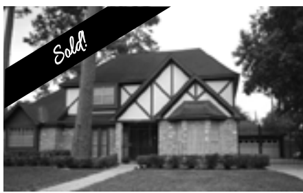
Olde Oaks | 3327 Woodbriar $225,000 | MLS# 3494289

$1,175,000 | MLS# 57128876 Amazing home/Luxurious pool! Huge game room! Golf Course views on Creek #1! 4/4.1/4, 7776 SF.