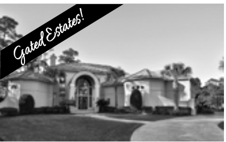
Ests. of Northgate Forest | 16815 Southern Oaks

Please contact me today if you are interested in buying or selling your home.