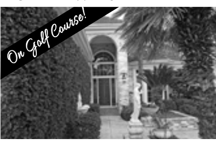
Northgate Forest | 2711 S. Southern Oaks

$279,900 | MLS# 58465782 Inviting home nestled on lovely cul-de-sac lot. Double porte co-chere, 5/3.1/3, 3499 SF; Recently updated kitchen, foyer & granite in all bathrooms.