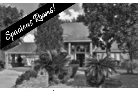
Olde Oaks | 15218 Lantern Creek

Beautifully updated throughout. Gated driveway. 4/2.5/2. Over 2900 SF. Impressive curb appeal.