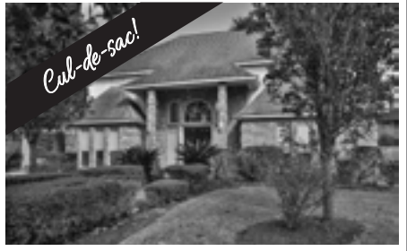
Olde Oaks | 15218 Lantern Creek $279,000 | MLS# 58465782 Spacious living in this beautiful family home. Brick fireplace is flanked by French doors. Nearly 3500 square feet.