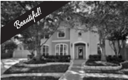
Waterford Park | 3107 Climbing Branch $389,900 | MLS# 90914645 Beautiful curb appeal and incredibly private backyard are just the beginning of what this beautiful 5/3.5/3 home has to offer!