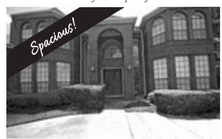
Olde Oaks | 15227 Lantern Creek $350,000 | MLS# 72181290 Beautiful custom home with circular driveway. Spacious room sizes. Split plan with 4 bedrooms up! Great master with updated bath.