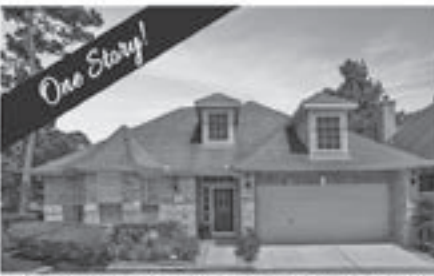
Champion Forest Villas | 16 Villa Bend Dr. $350,000 | MLS# 84326725

$995,000 | MLS# 76371291 Amazing Tucan spied home. Dramatic sweing ceilings, 3 fireplace. 2 bolnuma dinum, Renort style pool, trapical penaltic, putting genra, hope palepa. 5/5.13 - 5524 SE Carme ISD: Gatal Section.