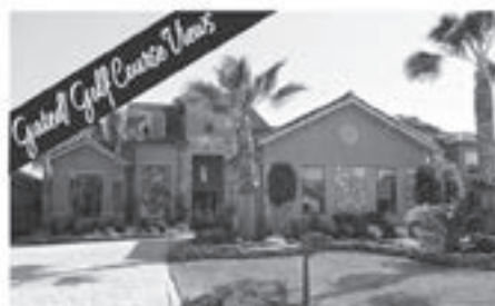
Northgate Forest | 16131 Villa Fontana $570,000 | MLS# 4377475

Gated chater home community. Maintenance free living. Open concept. amazing kitchen, huge room sizes. Beautifully apolated shroughout. 3/2:1/2 – 3388 SF