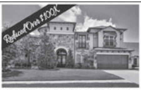
Oak Ests at Jacobs Reserve 147 Oak Ests Dr

$300,000 | MLS# 57128876 benting 1 stery countyard bone needed in The Green of WGE Light, bright & steam of gelf curved Benatiful living room softenplane, formed dining, study flor room, large matter softenplane. 22.1/2 3035 SE