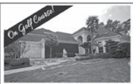
Northgate Forest | 2711 S. Southern Oaks

Please contact me today if you are interested in buying or selling your home.