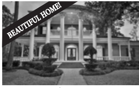
Northgate Forest | 16615 Southern Oaks Dr. $975,000 | MLS# 40312970 An amazing custom home located in Estates of Northgate Forest. Incredible views of lakes & course. Impressive curb appeal.

Champion Forest Villas | 16 Villa Bend Dr. $338,500 | MLS# 84326725 Are you ready for downsizing & maintenance free living but still have amazing room sizes? Nestled in a gated cluster home community of Champion Forest Villas.