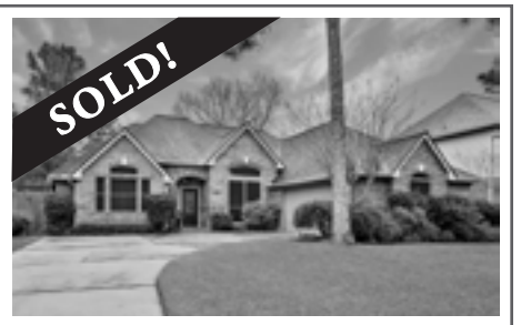
Wortham Park | 12730 Birch Falls Road $225,000 | MLS# 22979441 A very Beautiful and inviting 1 story home. Shows like new from the time you step inside. High ceilings, crown molding, very nicely updated.