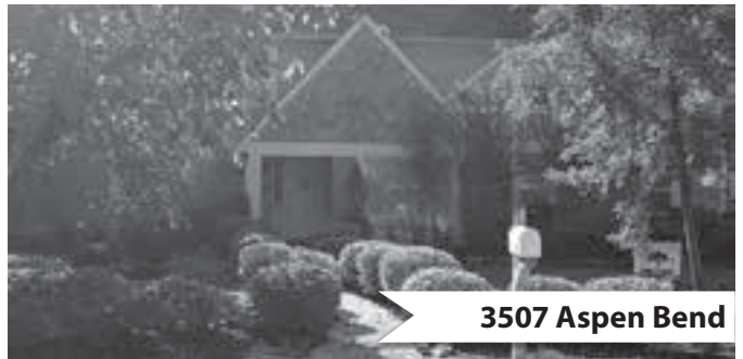
3507 Aspen Bend