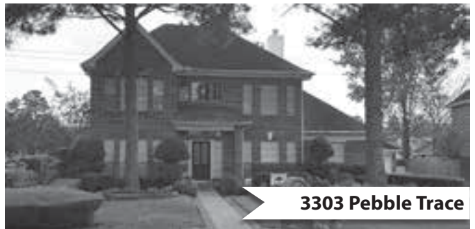
3303 Pebble Trace