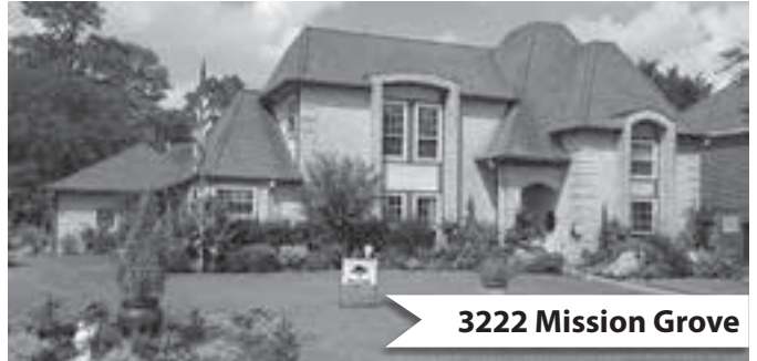
3222 Mission Grove

Congratulations to our October Yard of the Month Homeowners! Gardening is a gift that is shared with our neighbors. We appreciate your effort!