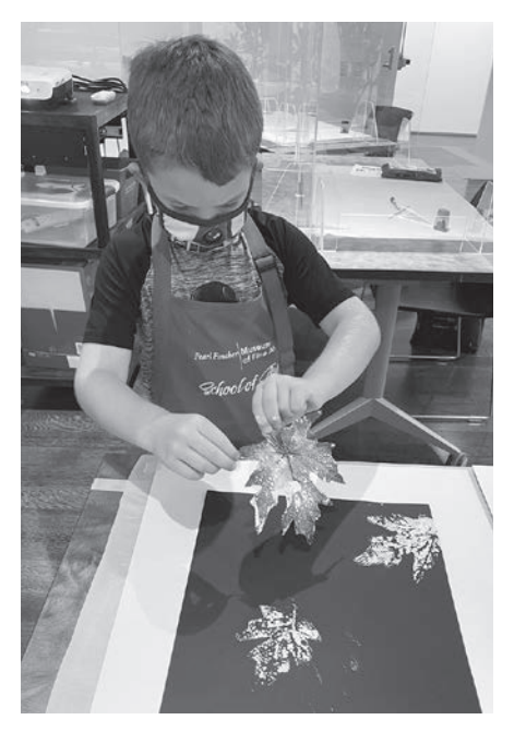
The new School of Art at the Pearl Fincher Museum of Fine Arts will offer its second session of classes beginning January 11. Classes will be offered for ages 8-10, 11-13, and adults. For more information or to register visit www.pearlmfa.org/schoolofart.

Registration for the next session of classes at the new Pearl Fincher Museum of Fine Arts School of Art is now underway, with classes set to begin January 11 .