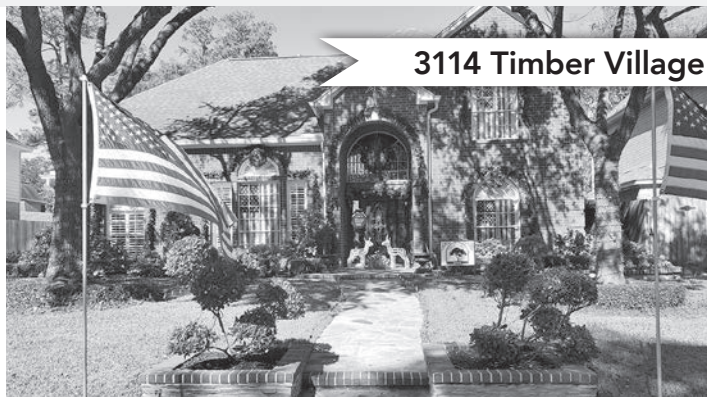
3114 Timber Village