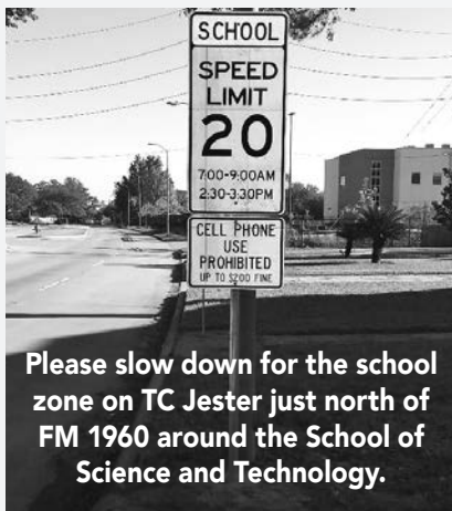
Please slow down for the school zone on TC Jester just north of FM 1960 around the School of Science and Technology.