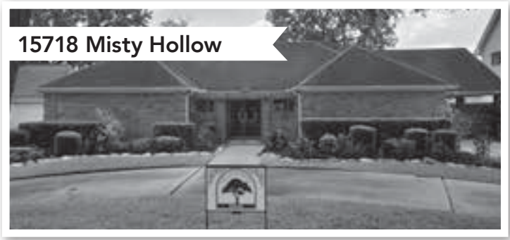
Olde Oaks Community Newsletter