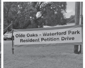
June 24 petition signing event