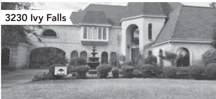
3230 Ivy Falls