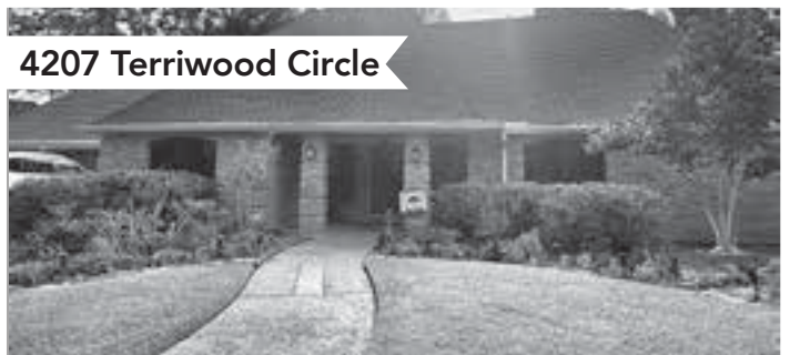
4207 Terriwood Circle