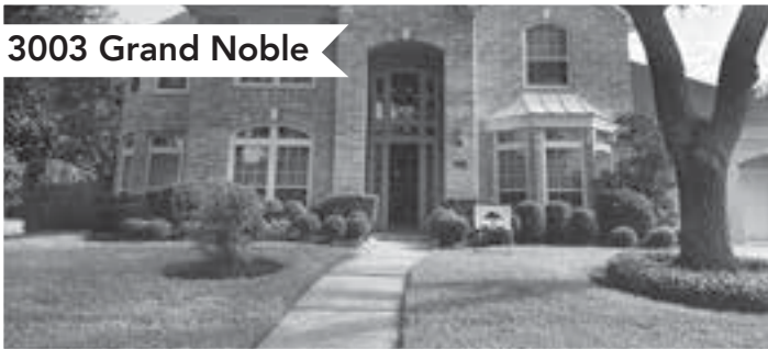
3003 Grand Noble