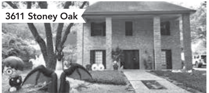
3611 Stoney Oak