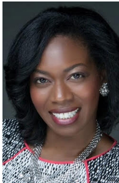
Naketrice Snow At Large