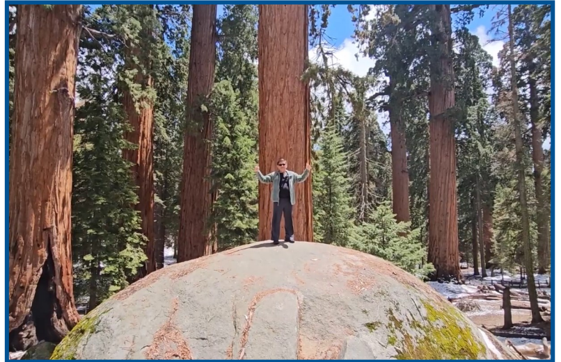
Sokhom amazed at God's creation.