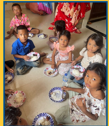
The majority of the children’s daily meals have consisted of rice and some dried fish.

Mark 10:13-16 And they were bringing children to Him so that He might touch them; but the disciples rebuked them. But when Jesus saw this, He was indignant and said to them, “Permit the children to come to Me; do not hinder them; for the kingdom of God belongs to such as these. Truly I say to you, whoever does not receive the kingdom of God like a child will not enter it at all.” And He took them in His arms and began blessing them, laying His hands on them.