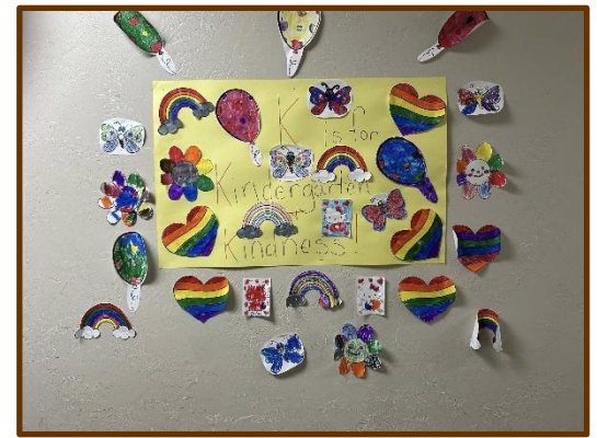
K is for Kindergarten Kindness wall