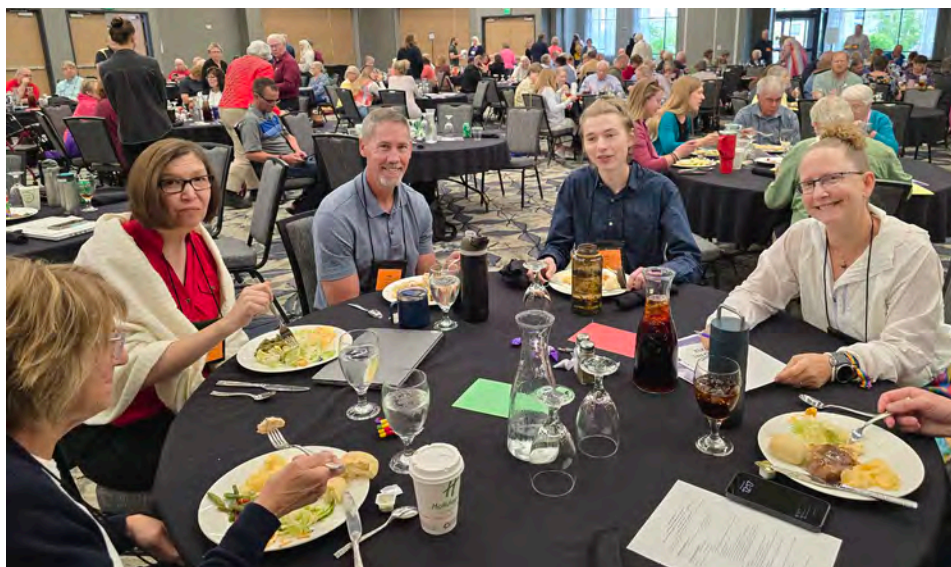
Voting members and visitors take a lunch break at the 2025 Northeastern Iowa Synod Assembly.