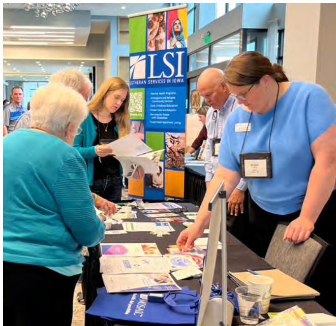
Assembly attendees visit displays at the Synod Assembly.

Shoppa emphasized that mentorship isn't just one to one; it can be a culture for the entire congregation where adults are invested in their youth and know their names, their struggles, and their hopes and dreams.