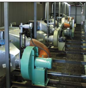
Polyethylene water chiller designed and built by Carmichael