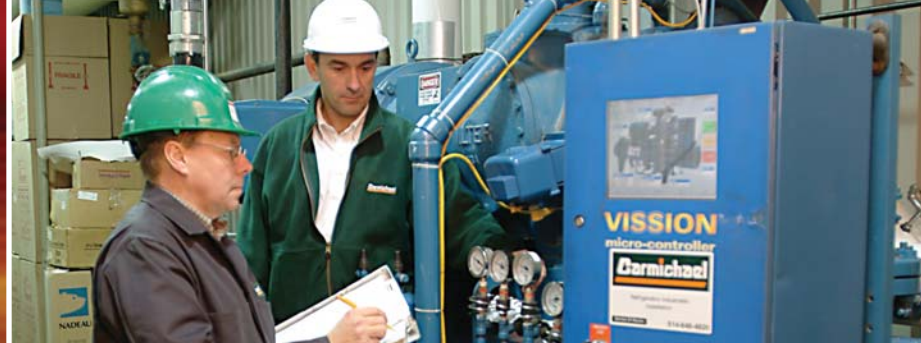
Industrial screw-type compressor

In the light of globalization and current economic trends, plant managers must more than ever focus on production processes. Their most important objectives: ensure product quality; guarantee the health and safety of employees; respect environmental legislation. Thermal systems that for whatever reason haven't kept up with production demands can only detract from attaining these and other objectives.