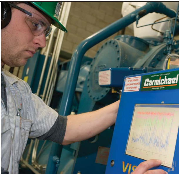
Screw compressor package for ammonia system

Food and beverage industries, pharmaceutical, plastics production as well as arenas.