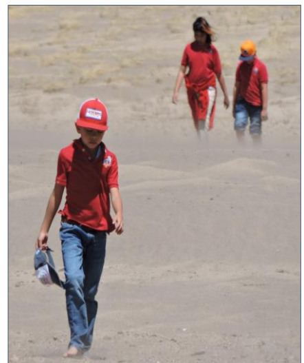
A windy trip to the sand dunes!