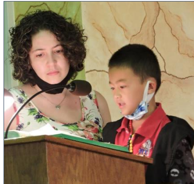
At Friday services, our students read the scriptures.