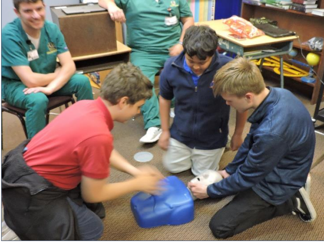
Middle school health class with TSC nursing students.