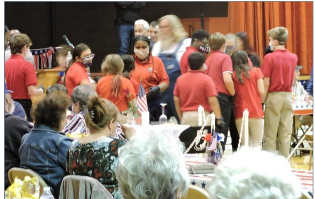
Students help serve at the Veteran's Day Luncheon.

This year, HTA has built a stronger relationship with The Fishers Peak Soup Kitchen. The wonderful staff at the soup kitchen provide school breakfast, lunch and snacks for just $4.50/day per student! We are grateful to have an affordable lunch program for our families.