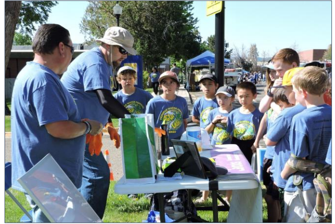
Students participate in the Water Festival at TSC.

This year, HTA has built a stronger relationship with The Fishers Peak Soup Kitchen. The wonderful staff at the soup kitchen provide school breakfast, lunch and snacks for just $4.50/day per student! We are grateful to have an affordable lunch program for our families.