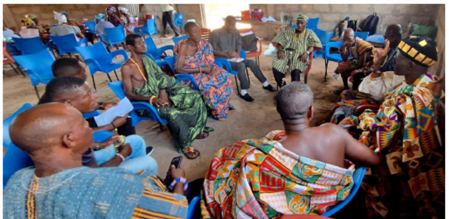
Traditional Chiefs in the Volta Region of Ghana making a gender justice response plan in their community as part of an ELCA supported Gender Justice workshop.