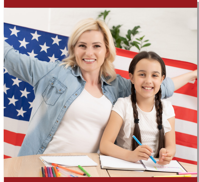
Recognize teachers who care about America!

Based on the nominees submitted, VFW chapters, called Posts, will recognize teachers in the following categories, K-5, 6-8 and 9-12. Posts then submit these winners' names and required documents to their District-level judging, who will forward their winners to the Department (or state) level. If your Department does not have a District judging, then submit to your Department Headquarters by Jan. 1. After judging, each Department then forwards their winners to VFW National Headquarters for consideration in the national awards contest.