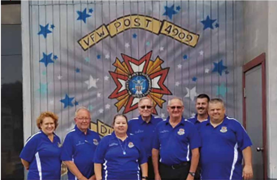
VFW POST 4909