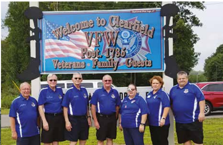
VFW POST 1785