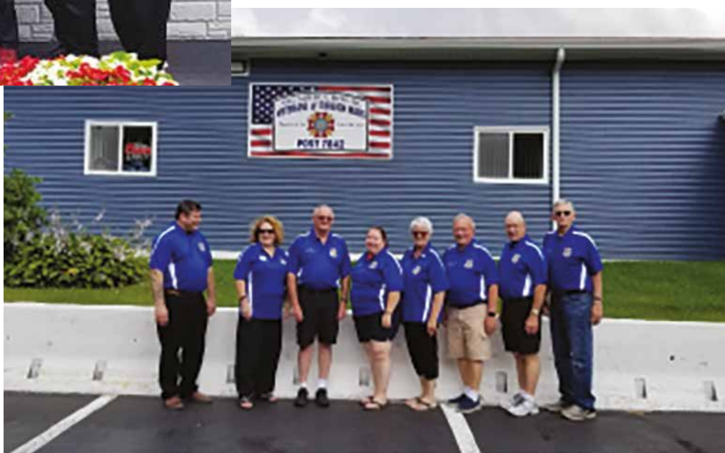
VFW POST 7842