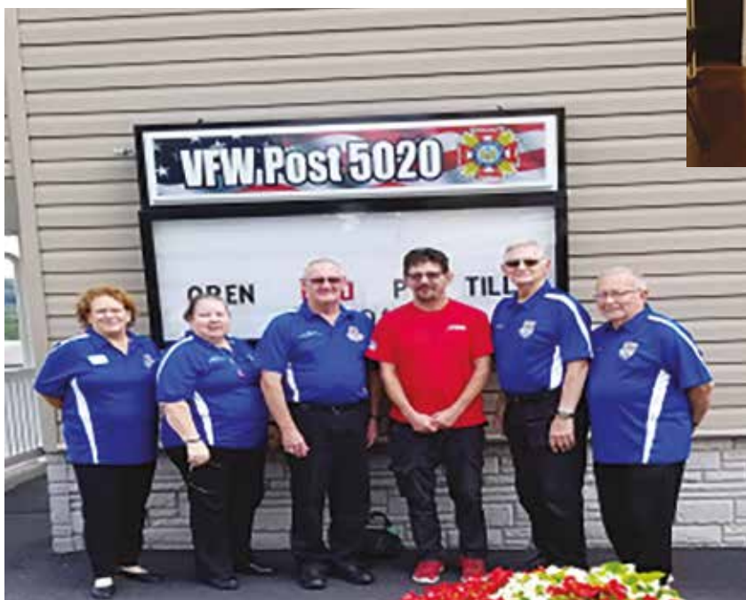
VFW POST 5020