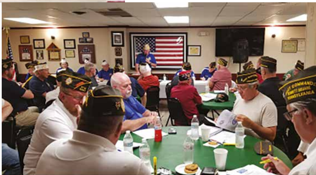
VFW POST 3460