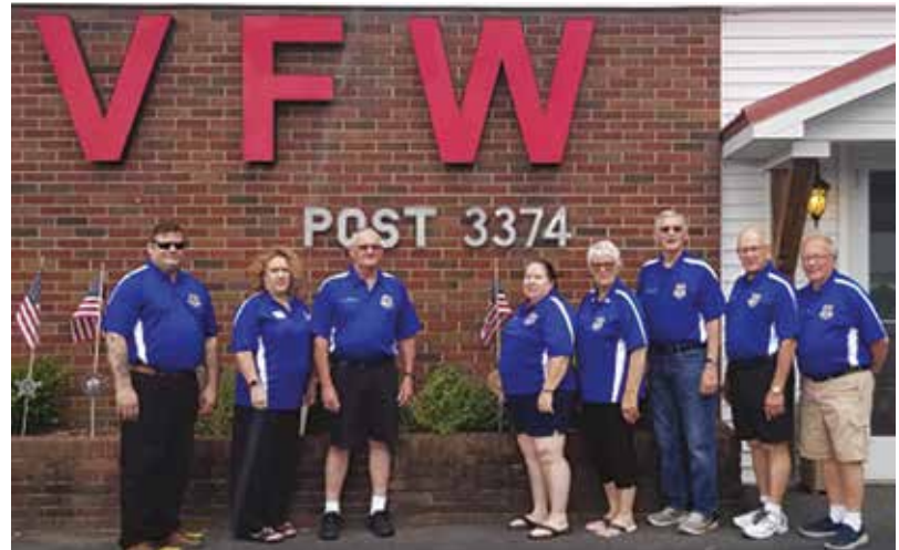
VFW POST 3374