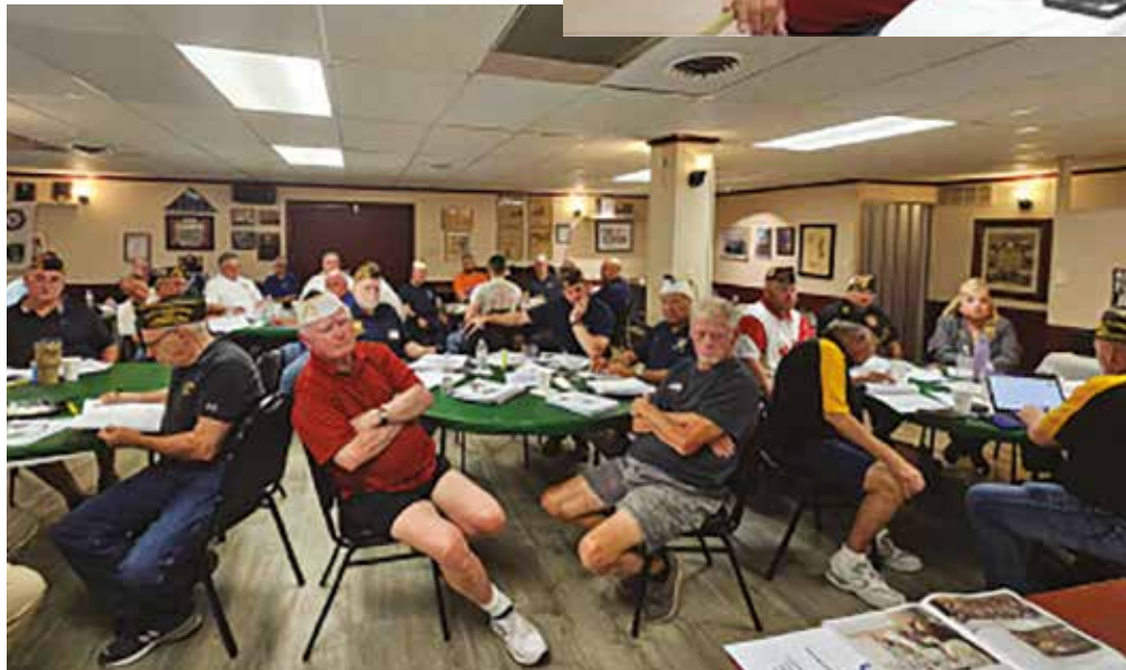
VFW POST 3368