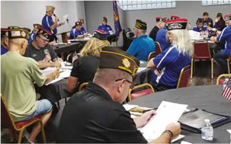
VFW POST 3376