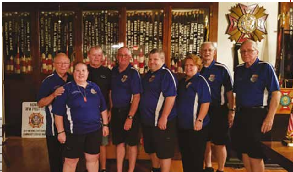
VFW POST 1754