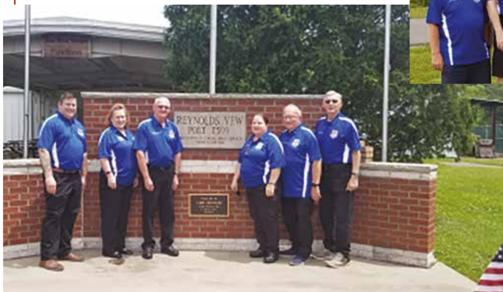
VFW POST 7599