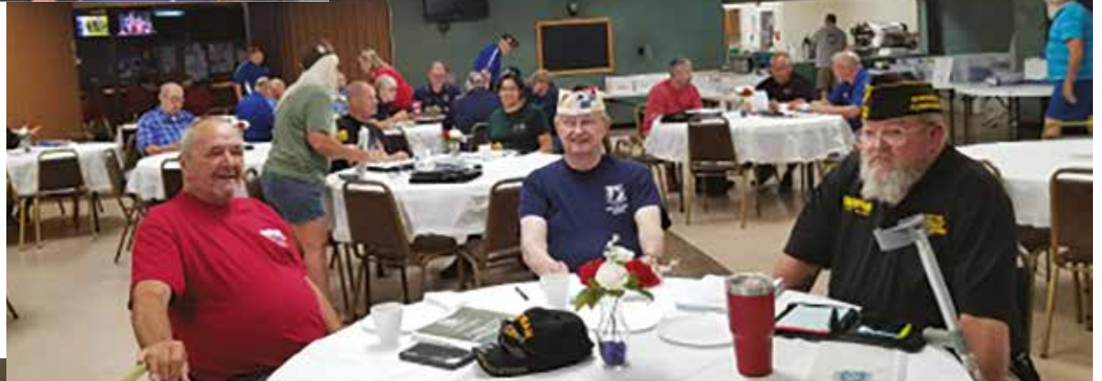
VFW POST 5754