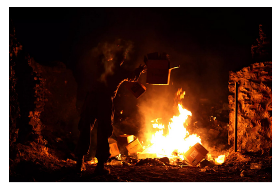
A U.S. Marine at forward operating base Zeebrudge in Helmand province, Afghanistan, burns trash in March 2013