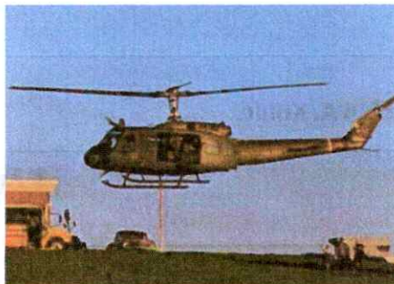
This is a Huey that my brother flew in when in Vietnam.