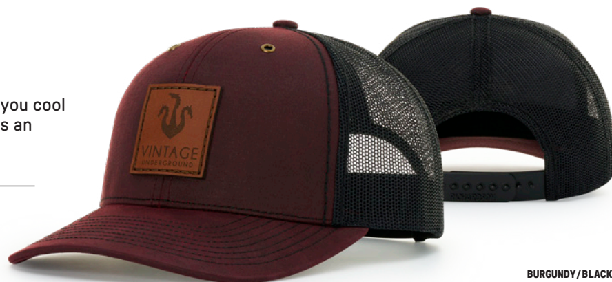
BURGUNDY/BLACK Genuine Etched Leather