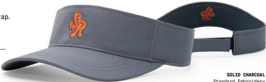
SOLID CHARCOAL Standard Embroidery

FIT: Adj. Micro Hook-and-Loop Backstrap with D-Ring SIZE: OSFM