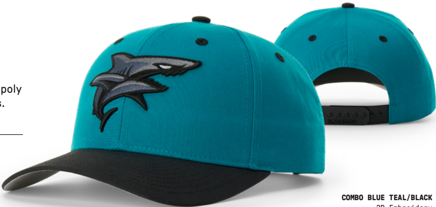
COMBO BLUE TEAL/BLACK 3D Embroidery

SHAPE: Mid Pro BILL: Precurved SWEATBAND: Standard FABRIC: 60% Cotton/40% Polyester FIT: Adj. Snapback SIZE: SM, MD-LG