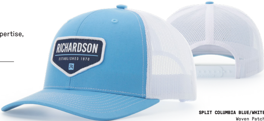
SPLIT COLUMBIA BLUE/WHITE Woven Patch

FIT: Adj. Snapback SIZE: Y, SM, MD-LG, XL