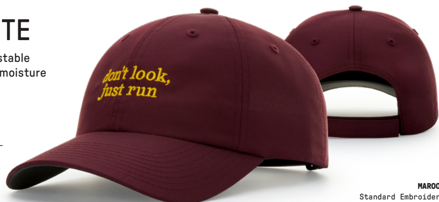
MAROON Standard Embroidery

SHAPE: Relaxed BILL: Precurved SWEATBAND: Stay-Dri FABRIC: 100% Polyester FIT: Adj. Hook-and-Loop Backstrap with D-Ring SIZE: SM, MD-LG