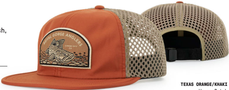
TEXAS ORANGE/KHAKI Woven Patch Design #: CUW2600

SHAPE: Relaxed BILL: Flat SWEATBAND: Stay-Dri FABRIC: 100% Polyester FIT: Adj. Nylon Woven Backstrap SIZE: OSFM