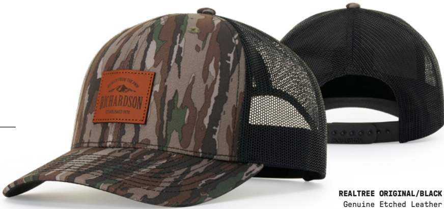
REALTREE ORIGINAL/BLACK Genuine Etched Leather