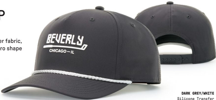
DARK GREY/WHITE Silicone Transfer