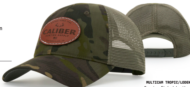
MULTICAM TROPIC/LODEN Genuine Etched Leather