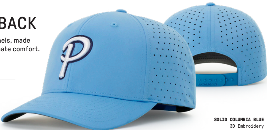
SOLID COLUMBIA BLUE 3D Embroidery

SHAPE: Mid Pro BILL: Precurved SWEATBAND: Stay-Dri FABRIC: 98% Polyester/2% Spandex FIT: R-Flex Adj. Snapback SIZE: SM, MD-LG