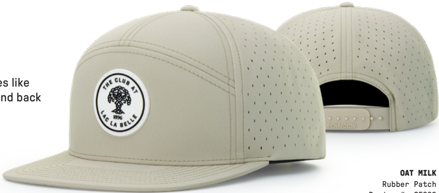
OAT MILK Rubber Patch Design #: GF939