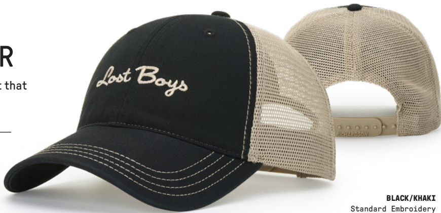
BLACK/KHAKI Standard Embroidery

SHAPE: Relaxed BILL: Precurved SWEATBAND: Standard FABRIC: F: 100% Cotton B: 100% Polyester FIT: Adj. Snapback SIZE: OSFM