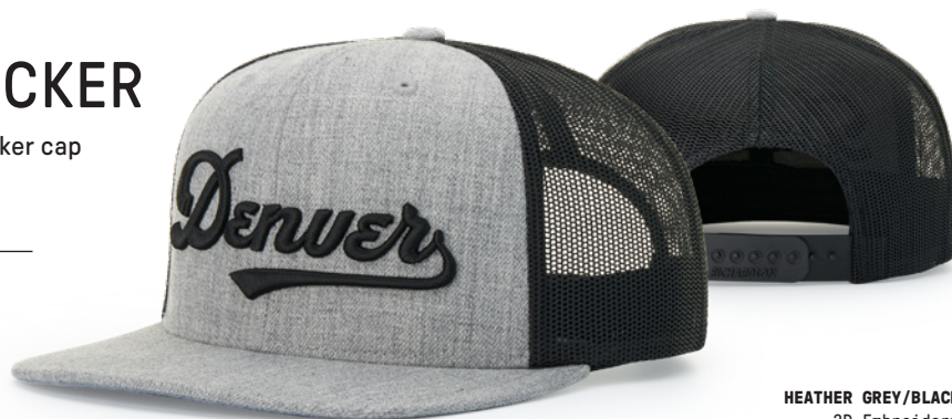
HEATHER GREY/BLACK 3D Embroidery