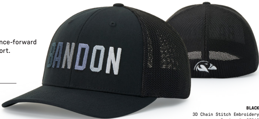
BLACK 3D Chain Stitch Embroidery Design #: GF918 with Back Embroidery

SHAPE: Mid Pro BILL: Precurved SWEATBAND: Comfort Stretch FABRIC: F: 60% Cotton/40% Polyester B: 95% Polyester/5% Spandex FIT: R-Flex SIZE: SM-MD, LG-XL