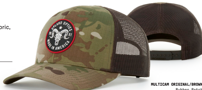
MULTICAM ORIGINAL/BROWN Rubber Patch Design #: OD514