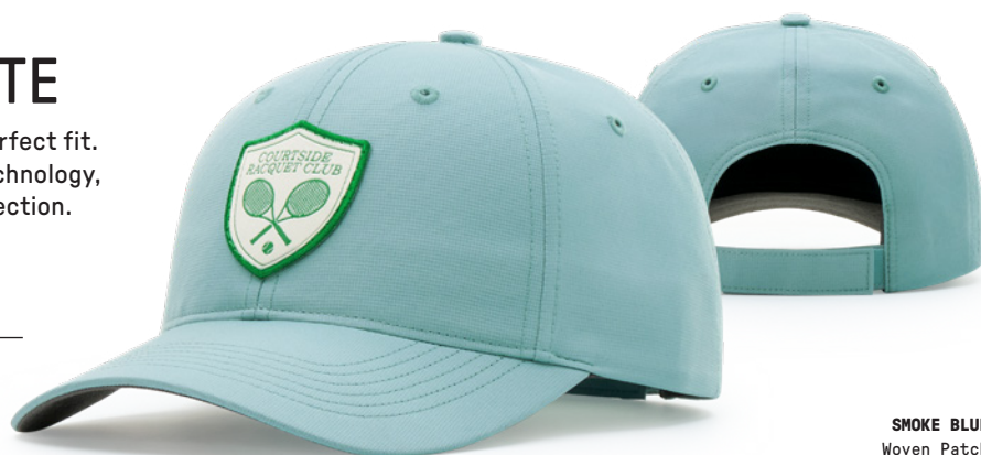
SMOKE BLUE Woven Patch

SHAPE: Low Pro BILL: Precurved SWEATBAND: Stay-Dri FABRIC: 100% Polyester FIT: Adj. Hook-and-Loop Backstrap SIZE: OSFM