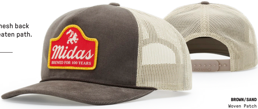
BROWN / SAND Woven Patch