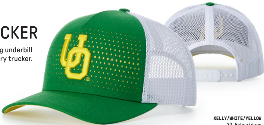
KELLY/WHITE/YELLOW 3D Embroidery

SHAPE: Mid Pro BILL: Precurved SWEATBAND: Standard FABRIC: F: 60% Cotton/40% Polyester B: 100% Polyester FIT: Adj. Snapback SIZE: OSFM