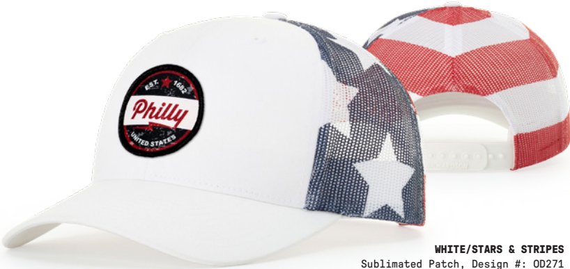
WHITE/STARS & STRIPES Sublimated Patch, Design #: OD271

SHAPE: Mid Pro BILL: Precurved SWEATBAND: Standard FABRIC: *F: 60% Cotton/40% Polyester *F: 97% Cotton/3% PU Spandex ^F: 100% Polyester B: 100% Polyester FIT: Adj. Snapback SIZE: OSFM