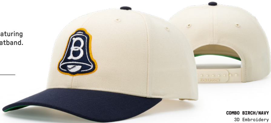
COMBO BIRCH/NAVY 3D Embroidery