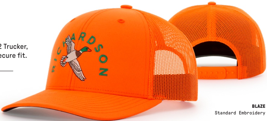
BLAZE Standard Embroidery