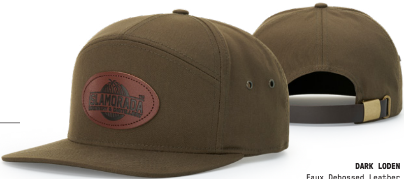
DARK LODÉN Faux Debossed Leather