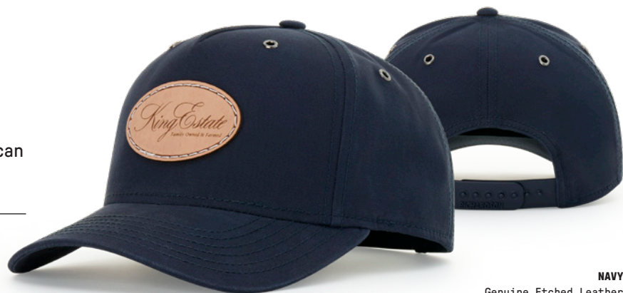
NAVY Genuine Etched Leather