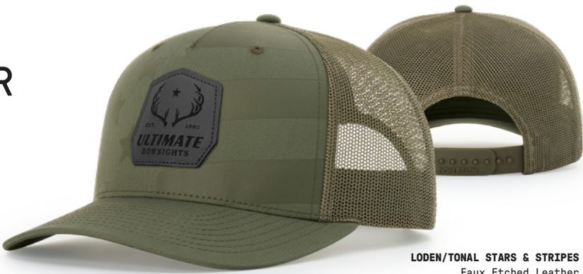
LODEN/TONAL STARS & STRIPES Faux Etched Leather Design #: OD498

SHAPE: Mid Pro BILL: Precurved SWEATBAND: Standard FABRIC: *F: 60% Cotton/40% Polyester *F: 97% Cotton/3% PU Spandex ^F: 100% Polyester B: 100% Polyester FIT: Adj. Snapback SIZE: OSFM