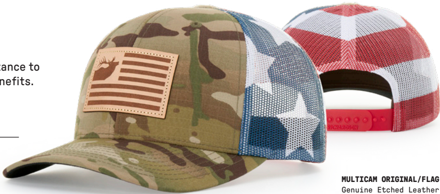
MULTICAM ORIGINAL/FLAG Genuine Etched Leather