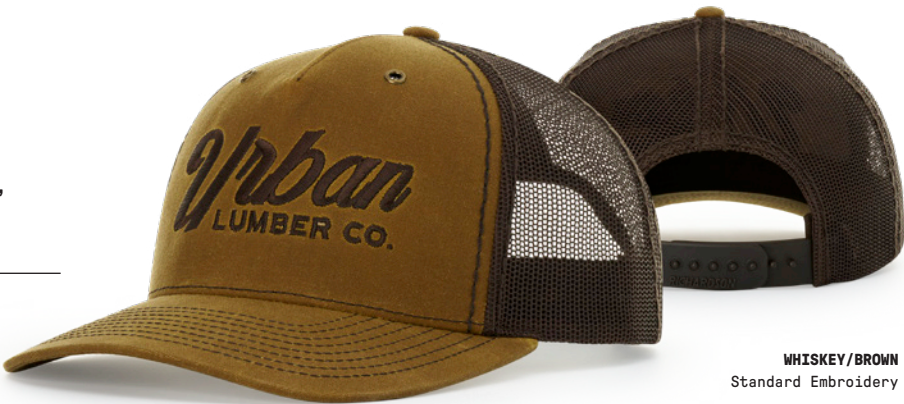
WHISKEY/BROWN Standard Embroidery