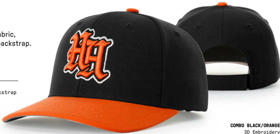
COMBO BLACK/ORANGE 3D Embroidery

FIT: Adj. Hook-and-Loop Backstrap SIZE: SM, MD-LG