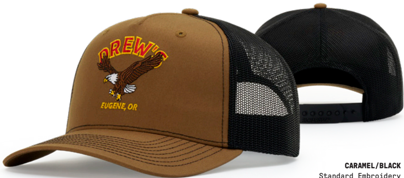
CARAMEL/BLACK Standard Embroidery