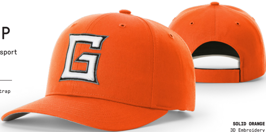
SOLID ORANGE 3D Embroidery

SHAPE: Mid Pro BILL: Precurved SWEATBAND: Standard FABRIC: 60% Cotton/40% Polyester FIT: Adj. Hook-and-Loop Backstrap SIZE: SM, MD-LG