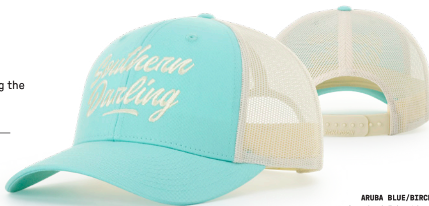
ARUBA BLUE/BIRCH Standard Embroidery Design #: 0D613