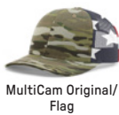
MultiCam Original/ Flag