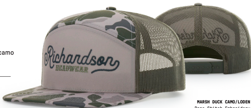
MARSH DUCK CAMO/LODEN Rope Stitch Embroidery

SHAPE: Smart 7 BILL: Flat SWEATBAND: Standard FABRIC: 100% Polyester FIT: Adj. Snapback SIZE: OSFM