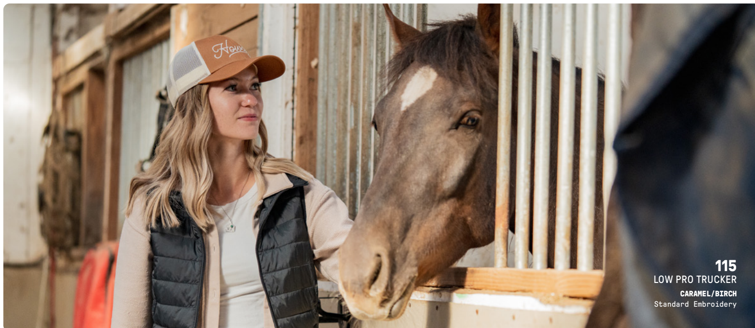
115 LOW PRO TRUCKER CAMEL/BIRCH Standard Embroidery

PLEASE CHECK INVENTORY. ALL SIZES MAY NOT BE AVAILABLE.