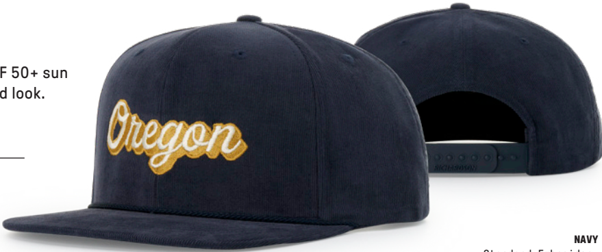
NAVY Standard Embroidery

SHAPE: High Pro BILL: Flat SWEATBAND: Standard FABRIC: 100% Cotton FIT: Adj. Snapback SIZE: OSFM