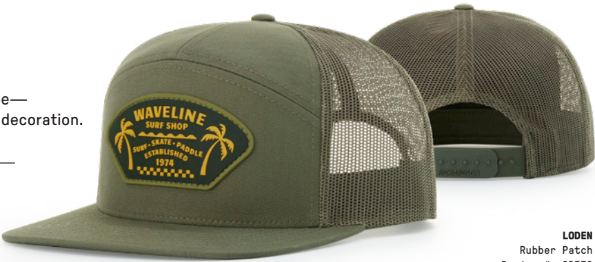
LODEN Rubber Patch Design #: 00573

SHAPE: Smart 7 BILL: Flat SWEATBAND: Standard FABRIC: F: 60% Cotton/40% Polyester B: 100% Polyester FIT: Adj. Snapback SIZE: OSFM