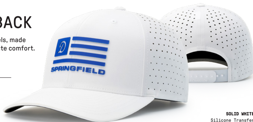
SOLID WHITE Silicone Transfer