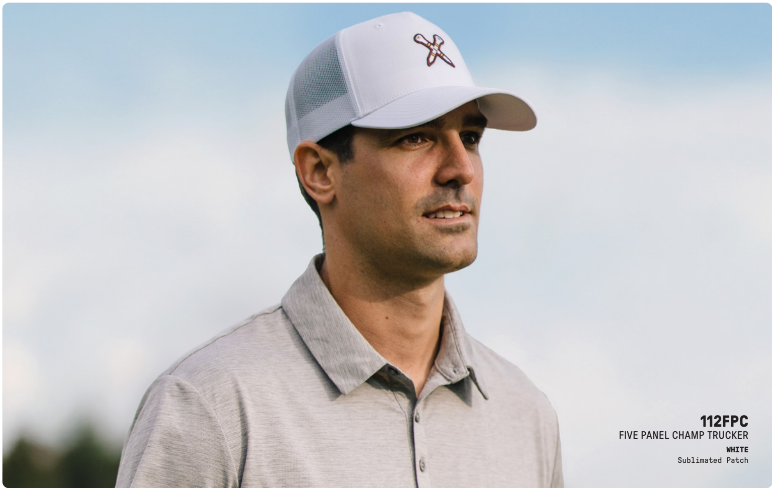
112FPC FIVE PANEL CHAMP TRUCKER WHITE Sublimated Patch