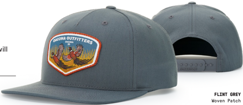
FLINT GREY Woven Patch Design #: CUW1500

FABRIC: 60% Cotton/40% Polyester +97% Cotton/3% Spandex FIT: Adj. Snapback SIZE: Y, MD-LG