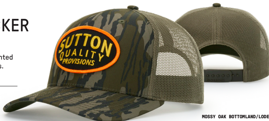
MOSSY OAK BOTTOMLAND/LODEN Embroidered Patch

FABRIC: *F: 60% Cotton/40% Polyester *F: 97% Cotton/3% PU Spandex ^F: 100% Polyester B: 100% Polyester