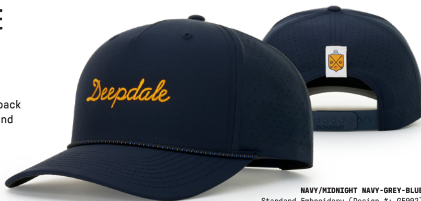
NAVY/MIDNIGHT NAVY-GREY-BLUE Standard Embroidery (Design #: GF992) with Woven Clip Label