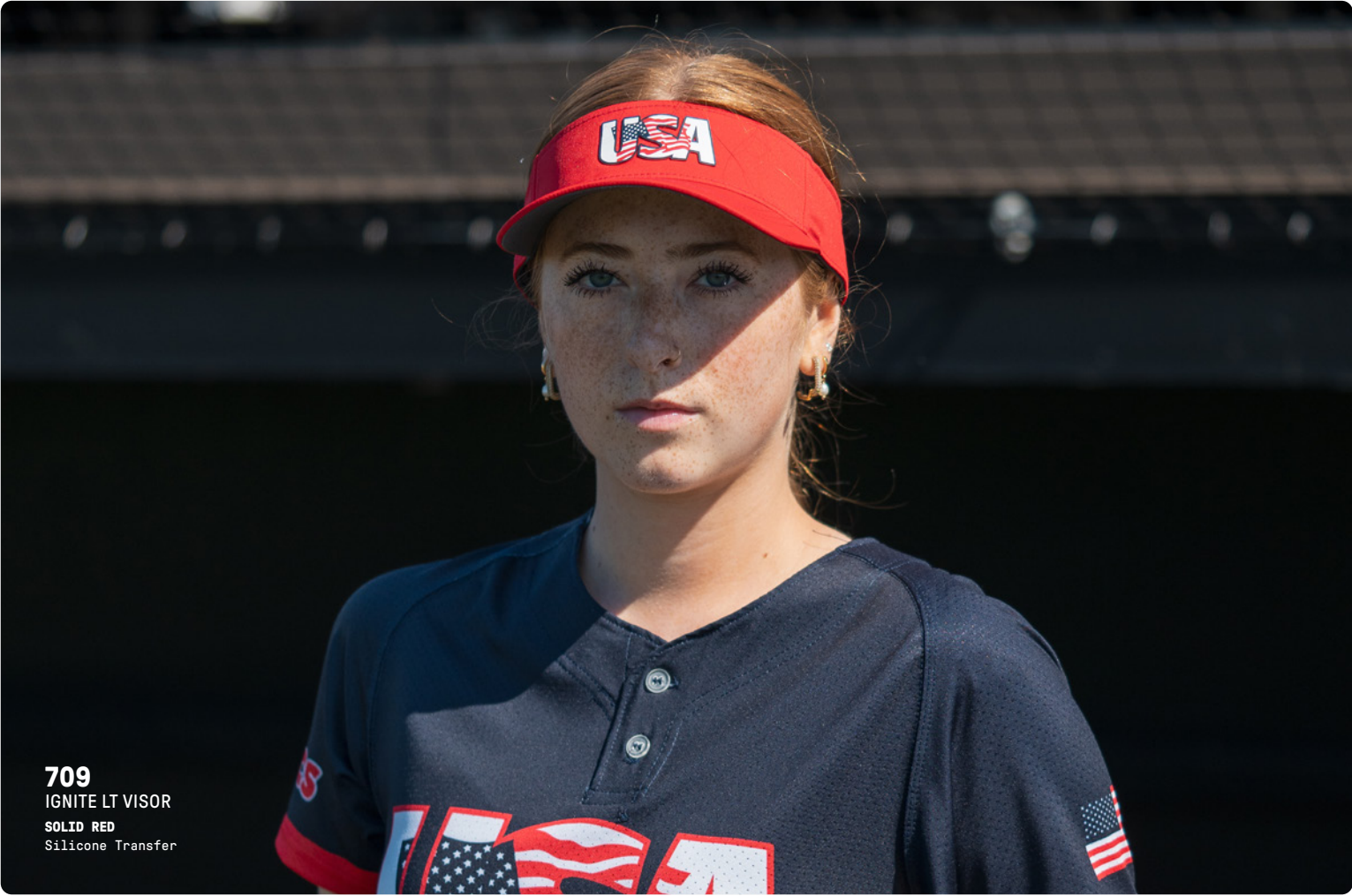
709 IGNITE LT VISOR SOLID RED Silicone Transfer