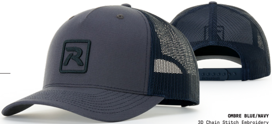
OMBRE BLUE/NAVY 3D Chain Stitch Embroidery