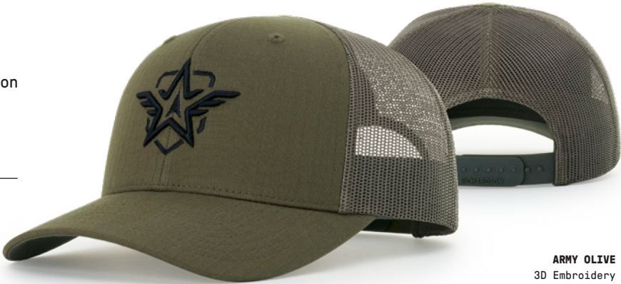
ARMY OLIVE 3D Embroidery