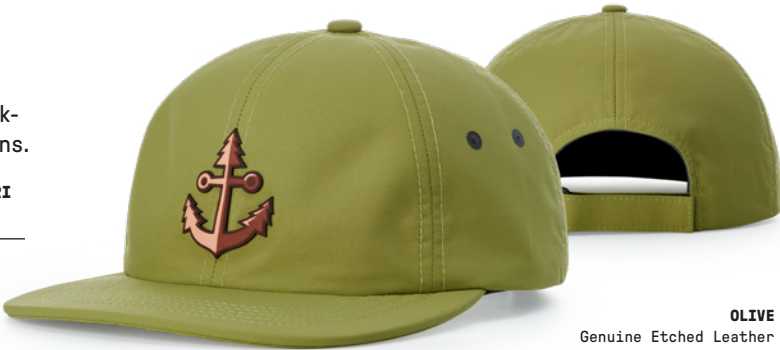
OLIVE Genuine Etched Leather

SHAPE: Relaxed BILL: Flat SWEATBAND: Stay-Dri FABRIC: 100% Nylon FIT: Adj. Micro Hook-and-Loop Backstrap with Stretch D-Ring SIZE: OSFM