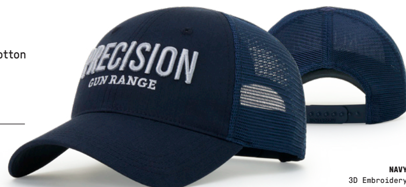
NAVY 3D Embroidery