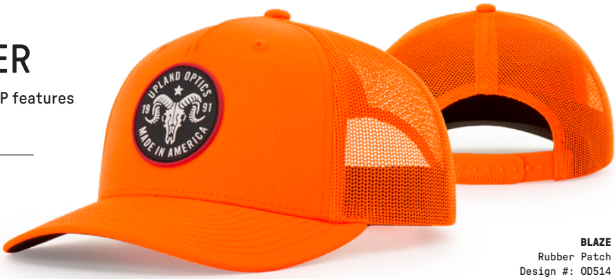
BLAZE Rubber Patch Design #: 00514