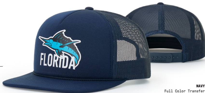
NAVY Full Color Transfer Design #: OD230