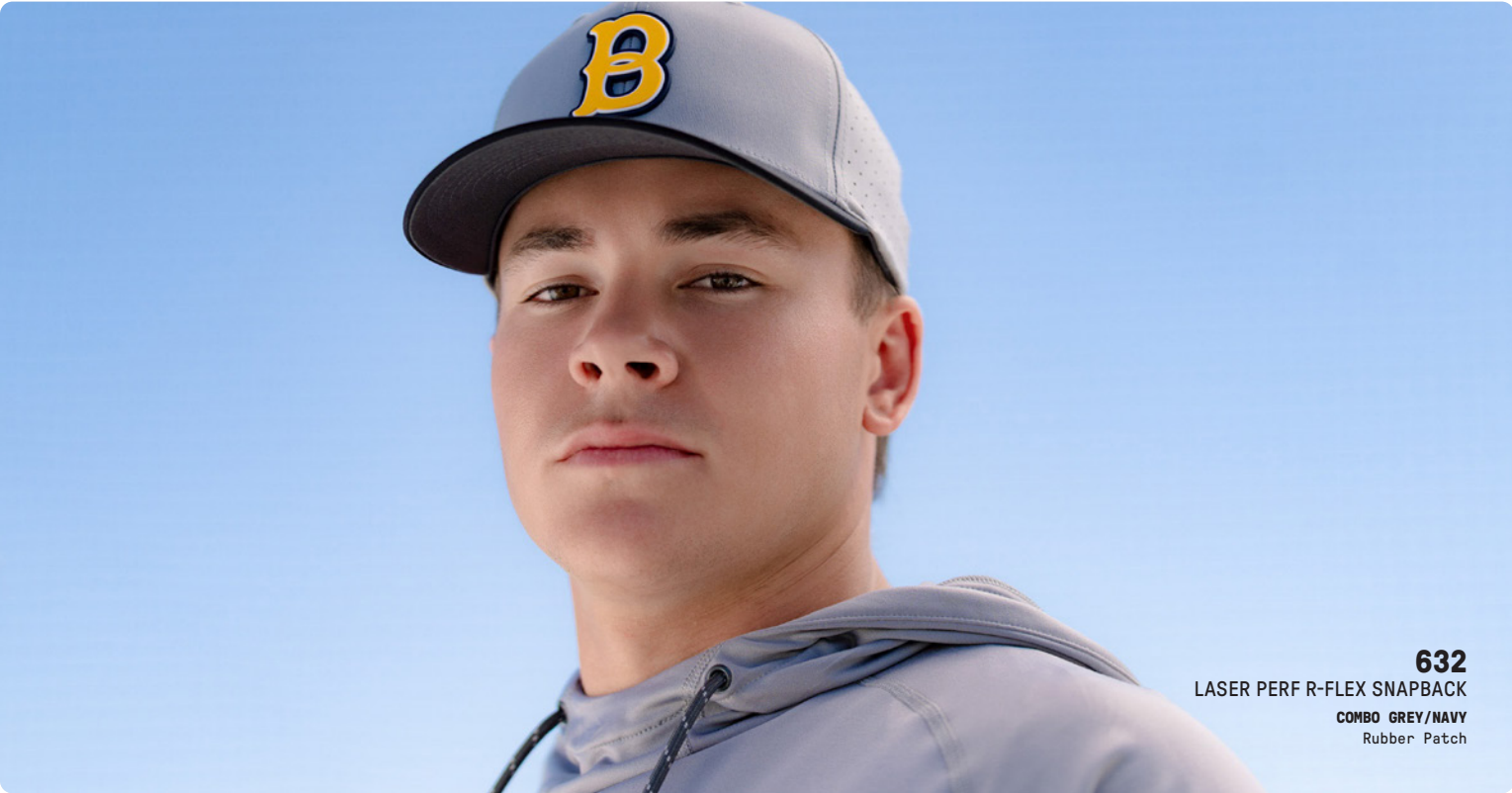
632 LASER PERF R-FLEX SNAPBACK COMBO GREY/NAVY Rubber Patch