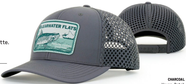
CHARCOAL Woven Patch

SHAPE: Mid Pro BILL: Precurved SWEATBAND: Stay-Dri FABRIC: 100% Polyester FIT: Adj. Snapback SIZE: OSFM