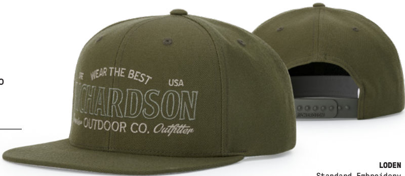
LODÉN Standard Embroidery