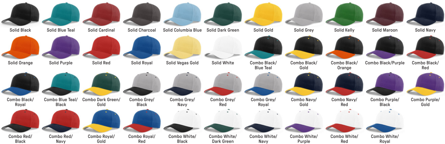
Underbill is Grey.