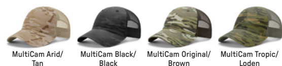
MultiCam Arid/ Tan