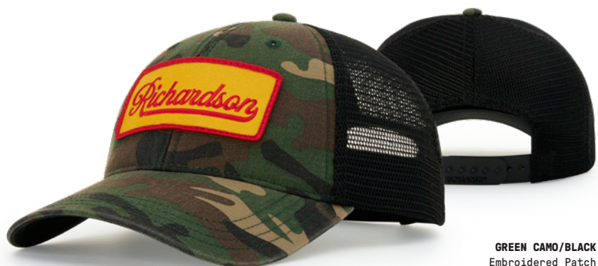
GREEN CAMO/BLACK Embroidered Patch

SHAPE: Relaxed BILL: Precurved SWEATBAND: Standard FABRIC: *100% Polyester *F: 100% Cotton B: 100% Polyester FIT: Adj. Snapback SIZE: OSFM