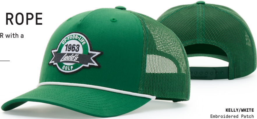
KELLY/WHITE Embroidered Patch