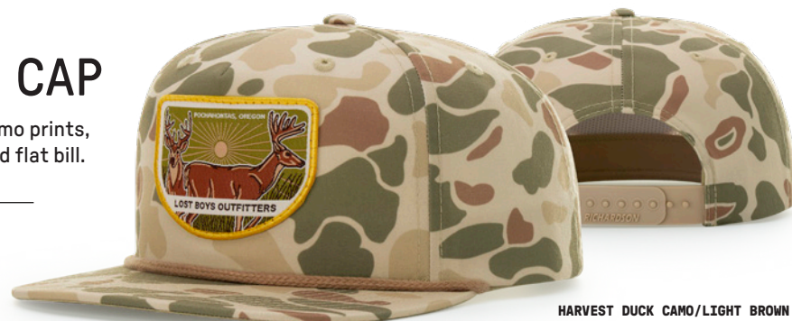
HARVEST DUCK CAMO/LIGHT BROWN Woven Patch Design #: CUW1700

SHAPE: Gramps BILL: Flat SWEATBAND: Standard FABRIC: 100% Polyester FIT: Adj. Snapback SIZE: OSFM