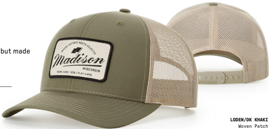
LODEN/DK KHAKI Woven Patch