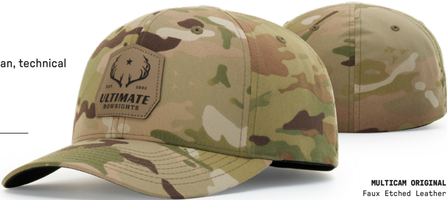
MULTICAM ORIGINAL Faux Etched Leather Design #: 0D498