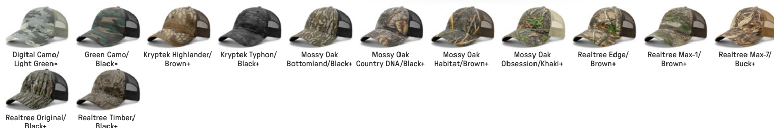
Digital Camo/ Light Green+ Green Camo/ Black+ Kryptek Highlander/ Brown+ Kryptek Typhon/ Black+ Mossy Oak Bottomland/Black+ Mossy Oak Country DNA/Black+ Mossy Oak Habitat/Brown+ Mossy Oak Obsession/Khaki+ Realtree Edge/ Brown+ Realtree Max-1/ Brown+ Realtree Max-7/ Buck+ Realtree Original/ Black+ Realtree Timber/ Black+