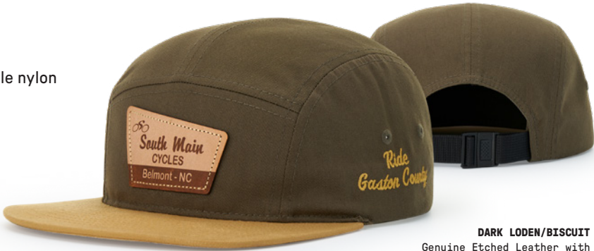
DARK LODEN/BISCUIT Genuine Etched Leather with Side Embroidery

SHAPE: Camper BILL: Flat SWEATBAND: Standard FABRIC: 60% Cotton/40% Polyester FIT: Adj. Nylon Woven Backstrap SIZE: OSFM