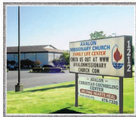
Avalon Missionary Church, 1500 Lower Huntington Rd Fort Wayne, IN 46819 (260) 747-1531 www.avalonfw.com