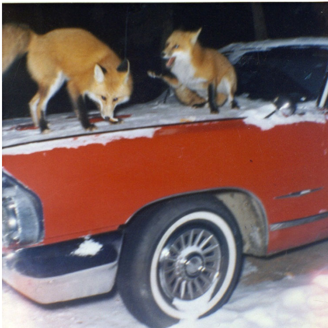
Fox during mating season