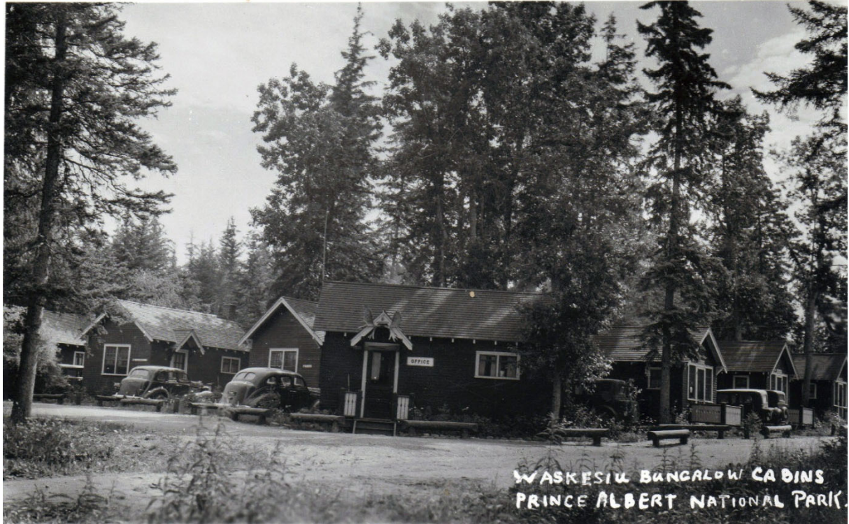
Waskesiu Bungalow Cabins