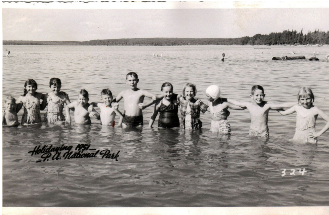
Kids in swimming lessons