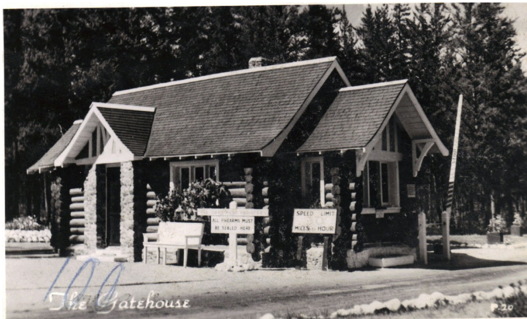
Gate House at South entrance to the park