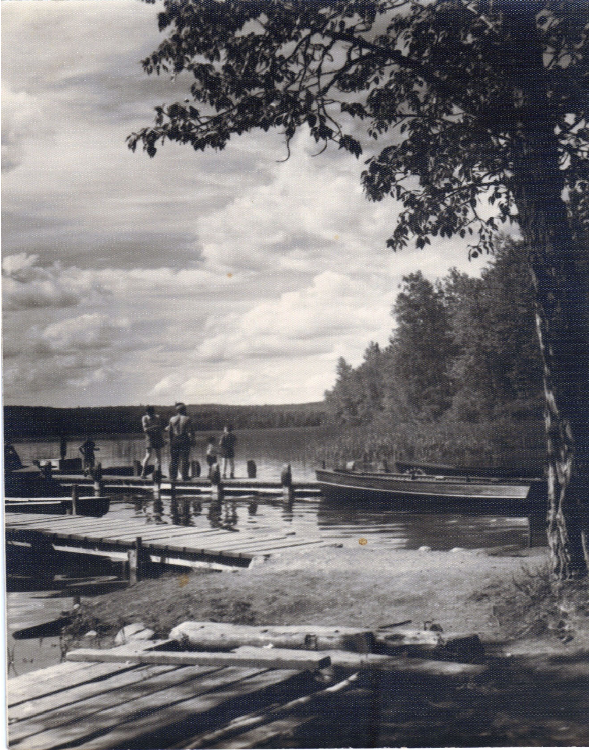
First Hanging Heart Lakes 1950