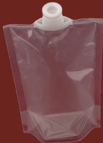
STAND-UP POUCH PACKS

are used for sealing Serum Neck Finishes. The Rubber Stopper is inserted into the neck of the bottle assuring a tight seal and the Aluminum Crimp Seal is then placed over the stopper and crimped under the bottle lip.