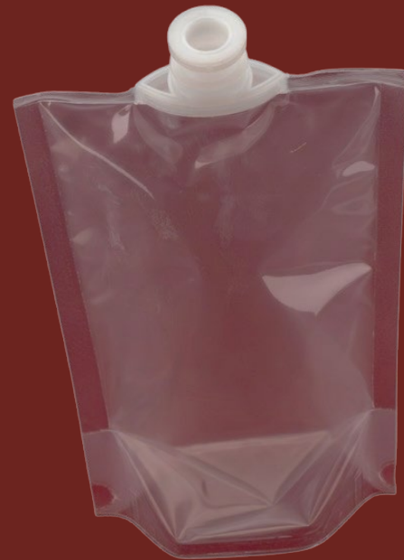
STAND-UP POUCH PACKS

Genesis Industries, Inc. is committed to ensuring our products are manufactured to high quality standards. We strive to ensure customer satisfaction by providing quality products in a timely manner with responsive communication.