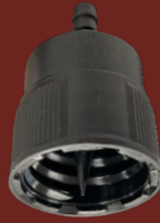
ONE PIECE PILLOW PAK DRAW-OFF CAP WITH SPIKE

Standard Material: Low Density Polyethylene (LDPE) Medium Density Polyethylene (MDPE) High Density Polyethylene (HDPE)