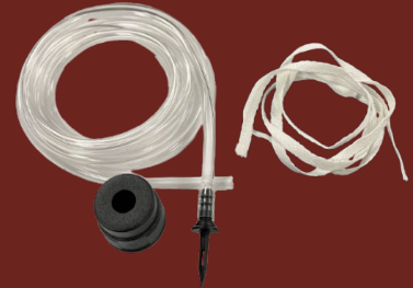
TWO PIECE PILLOW PAK DRAW-OFF CAP WITH SPIKE, DRAW-OFF TUBE & STRING

Standard Material: High Density Polyethylene (HDPE)