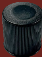
FLASK PAK OVER CAP

Standard Material: High Density Polyethylene (HDPE)