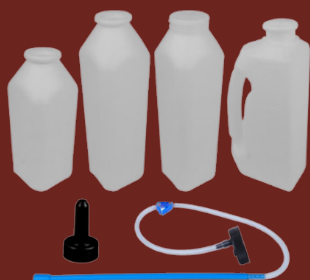
CALF-MAID® BOTTLES & ACCESSORIES

Back Pack Straps are made of abrasion resistant nylon webbing. In addition to wearing the Back Pack, the Strap allows users to hang the Back Pack onto a chute or in a barn.