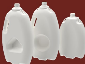
5 LITER BACK PACKS

Standard Material: High Density Polyethylene (HDPE)