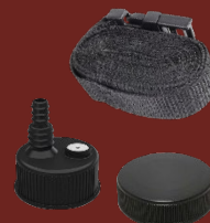
BACK PACK ACCESSORIES

Standard Material: High Density Polyethylene (HDPE)