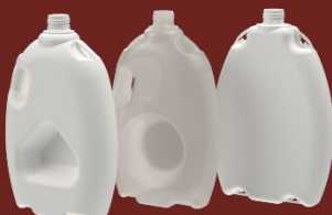
2.5 LITER BACK PACKS

Standard Material: High Density Polyethylene (HDPE)