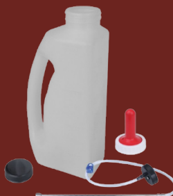
HANDI GRIP™ BOTTLES & ACCESSORIES

Calf-Maid® Bottles are made with High Density Polyethylene (HDPE) which makes them durable and reliable. When used with Calf-Maid® patented Snap On and Threaded Nipples, this innovative calf feeding system will provide calves with continuous milk flow with no leaks. Calf-Maid® Threaded and Snap On Bottles are available in 2, 3 and 4 Quart / Liter.