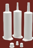
60 ML BARRELS

Available Caps: Long Nose (C12), Paste Tip (C15), Sure-Grip™ Short Oral (C155-36), Broad Nose (C28300SS)