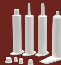
36 ML BARRELS

Available Caps: Long Nose (C12), Paste Tip (C15), Luer Slip (C13)