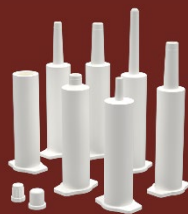
15 ML BARRELS

Available Caps: Wide Mouth (C02), Paste Tip (C15)