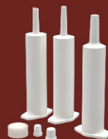
32 ML BARRELS

Available Caps: Long Nose (C12), Paste Tip (C15)