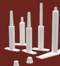
7 ML BARRELS

Available Nozzles: Short Nose (B22), 1.8" Extended Nose (B52), 2" Extended Nose (B53), Extended Nose (B72), Sure-Grip™ Short Nose (B125)