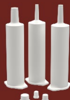
80 ML BARRELS

Available Caps: Long Nose (C12), Paste Tip (C15), Broad Nose (C28300SS)