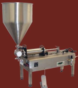
SVS SINGLE CYLINDER PISTON FILLER

Genesis offers Piston Fillers made with stainless steel construction. These Piston Fillers are powered by air and highly accurate. The SVS includes a 12 gallon stainless steel hopper and a built-in scale. Fill from fractional ounces up to 157 ounces using auto cycle mode or single foot pedal control. SVS is ideal for large production runs. The SVS-J includes a 5 gallon stainless steel hopper and a built-in scale. Fill from fractional ounces up to 8.5 ounces using auto cycle mode or single foot pedal control. The SVS-J is ideal for small production runs.