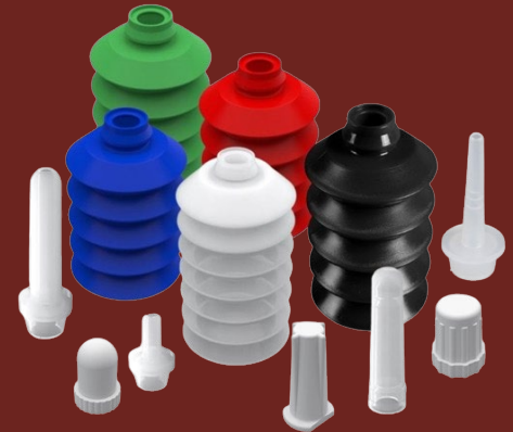
SQUEEZE-JET™ DISPENSERS & ACCESSORIES

Squeeze-Jet™ Dispensers are an accordion-shaped container with a variety of snap-in dispensing tips accommodating blunt needles. The LDPE Squeeze-Jet™ features a contoured base fitting the thumb comfortably for full control while dispensing. Squeeze-Jet™ Dispensers are molded to include a dripless feature for technical placement making these a great choice for precision work without dripping. Squeeze-Jet™ Dispensers are available in 30 ML, 40 ML and 60 ML. Tip and cap options include cannula, oral / enema, luer slip and luer lock.