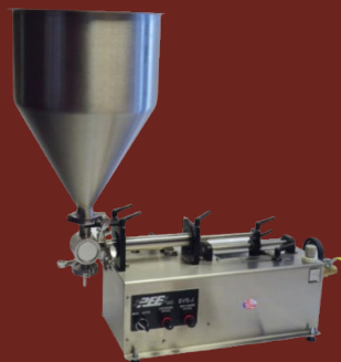
SVS-J MINIATURE SINGLE CYLINDER PISTON FILLER