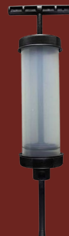
550 ML SYRINGE

Genesis Industries, Inc. is committed to ensuring our products are manufactured to high quality standards. We strive to ensure customer satisfaction by providing quality products in a timely manner with responsive communication.