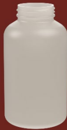
400 ML THREADED BOTTLES

Standard Material: High Density Polyethylene (HDPE)