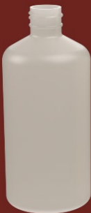
250 ML THREADED BOTTLES

Standard Material: High Density Polyethylene (HDPE)