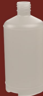
625 ML THREADED BOTTLES (Hook or Hang Tab)

Standard Material: Low Density Polyethylene (LDPE) High Density Polyethylene (HDPE)