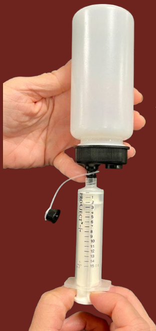
Continuous Threaded Bottle used with Luer Lock Vented Draw-Off Cap and Luer Lock Syringe

Genesis Industries, Inc. is committed to ensuring our products are manufactured to high quality standards. We strive to ensure customer satisfaction by providing quality products in a timely manner with responsive communication.