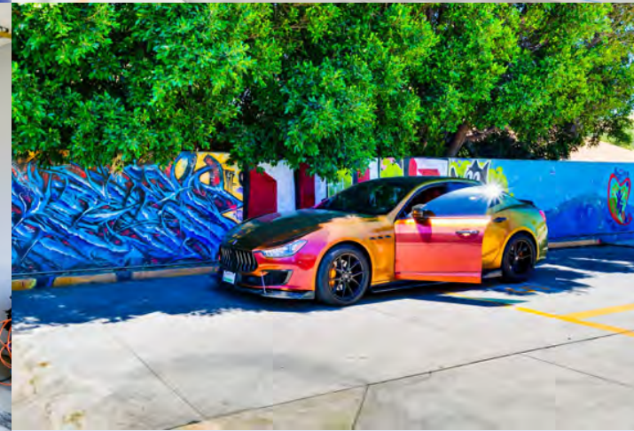
Auto Detail or Window Tint