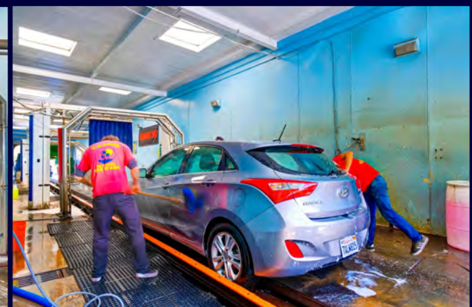
CAR WASH - 2 Bays Automotive Center - View of the Lake - Adjacent to Fwy 15 - Upstairs office