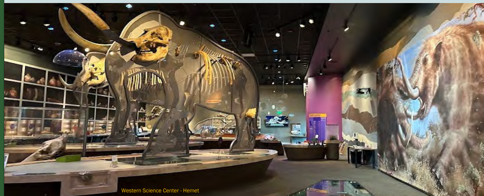
Western Science Center - Hemet