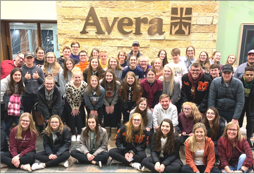
Youth Decorating Christmas Trees at Avera