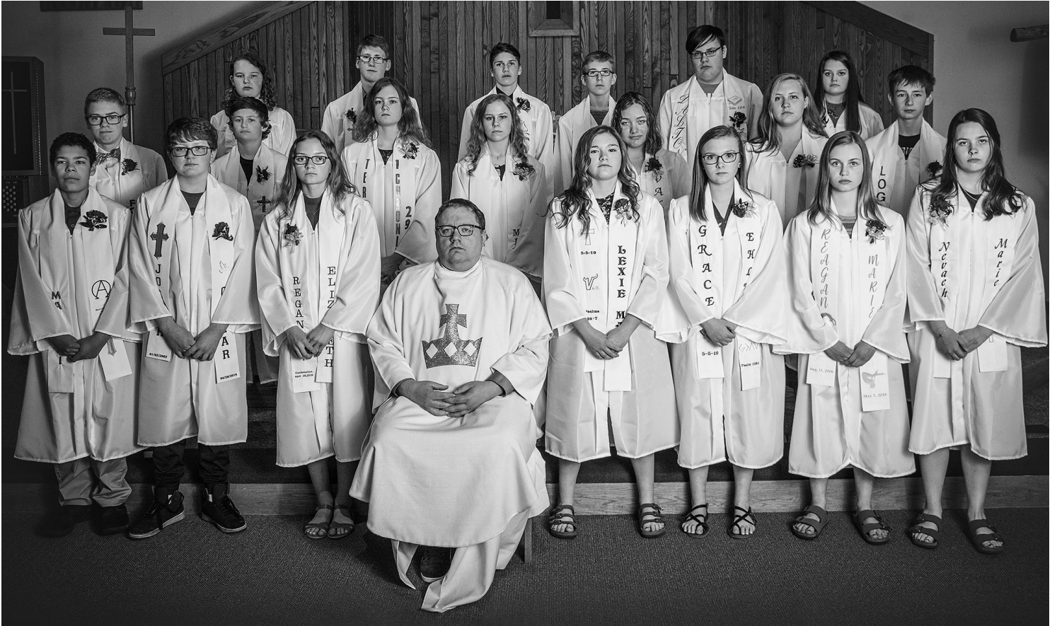
Confirmation Class of 2019