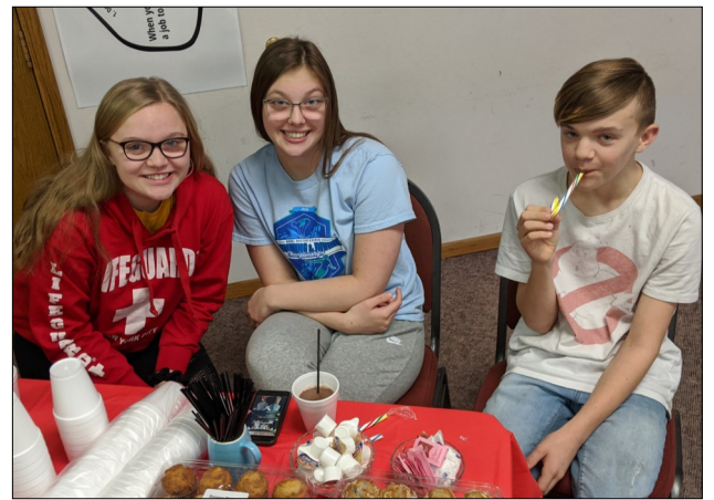
Annual Cookie Walk