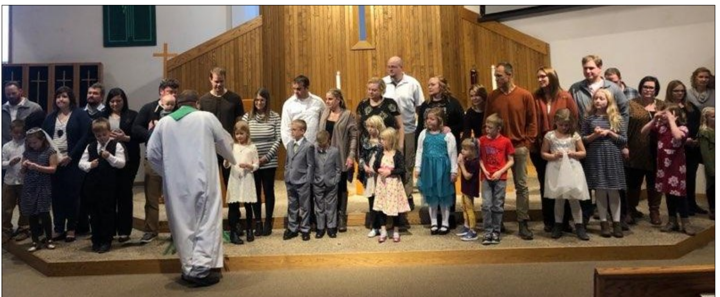
First Communion Milestone