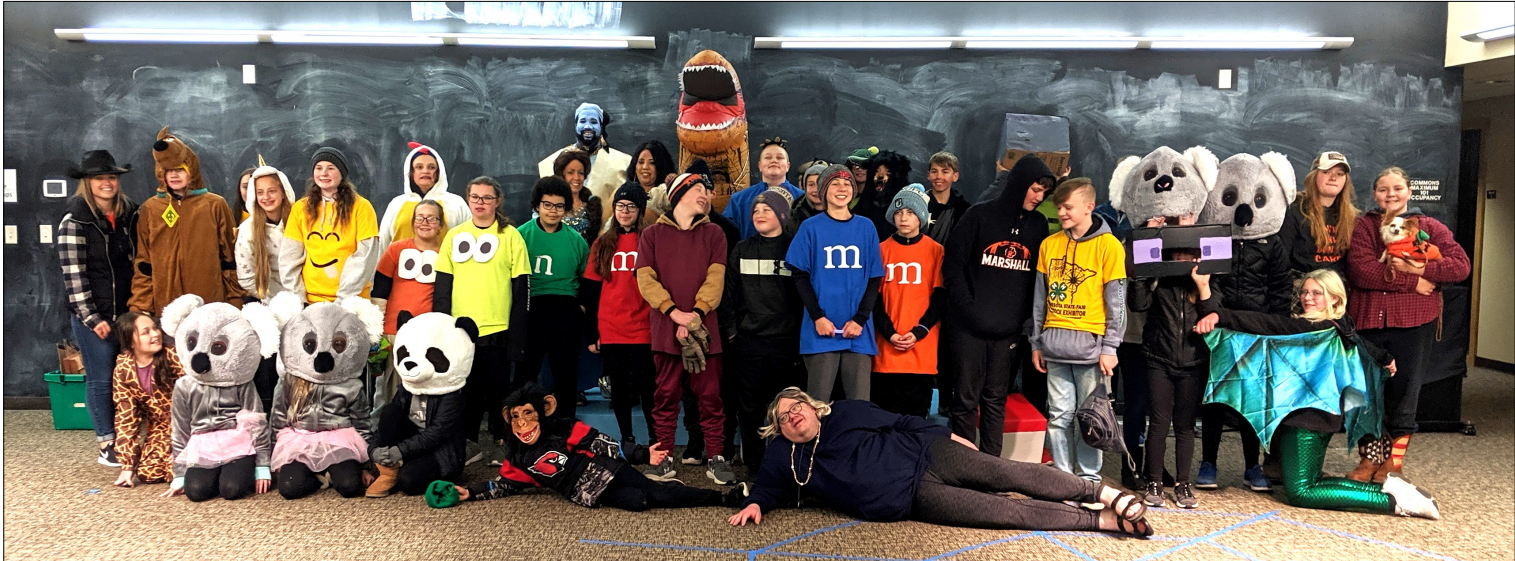
Annual Trunk or Treat