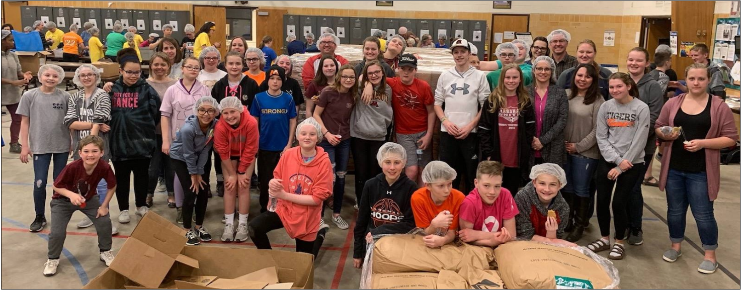
Confirmation Class packaging food for "Kids Against Hunger"