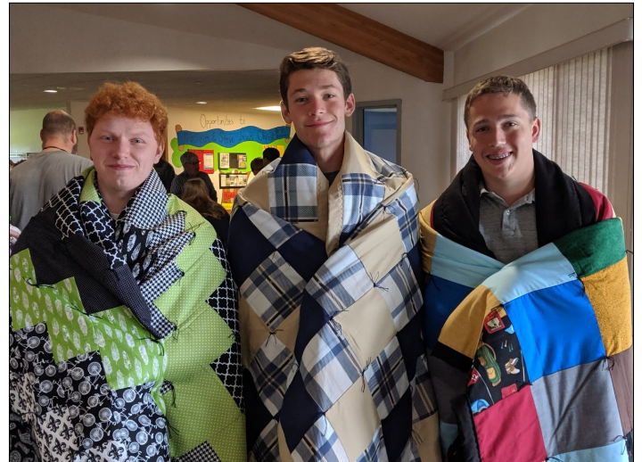
2019 High School Graduates