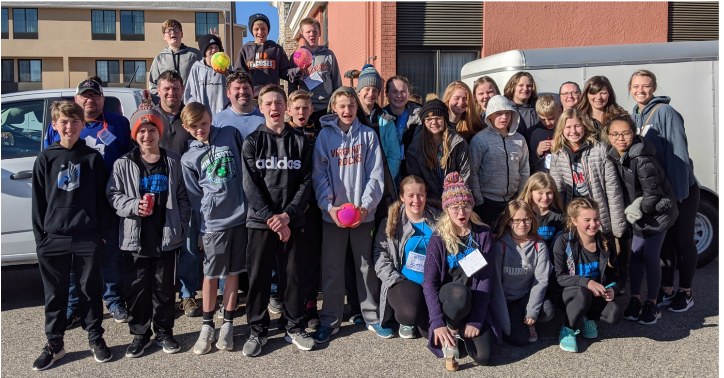
Jr. High Youth Gathering in Willmar