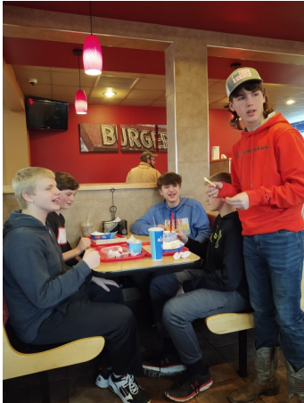
Each month the Confirmation huddle groups gather for a night of fellowship