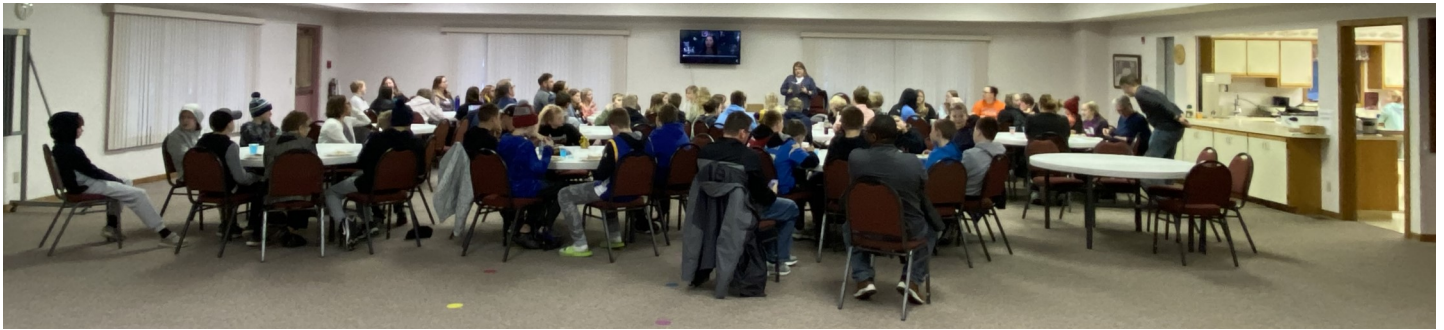
Confirmation classes on Wednesday evenings