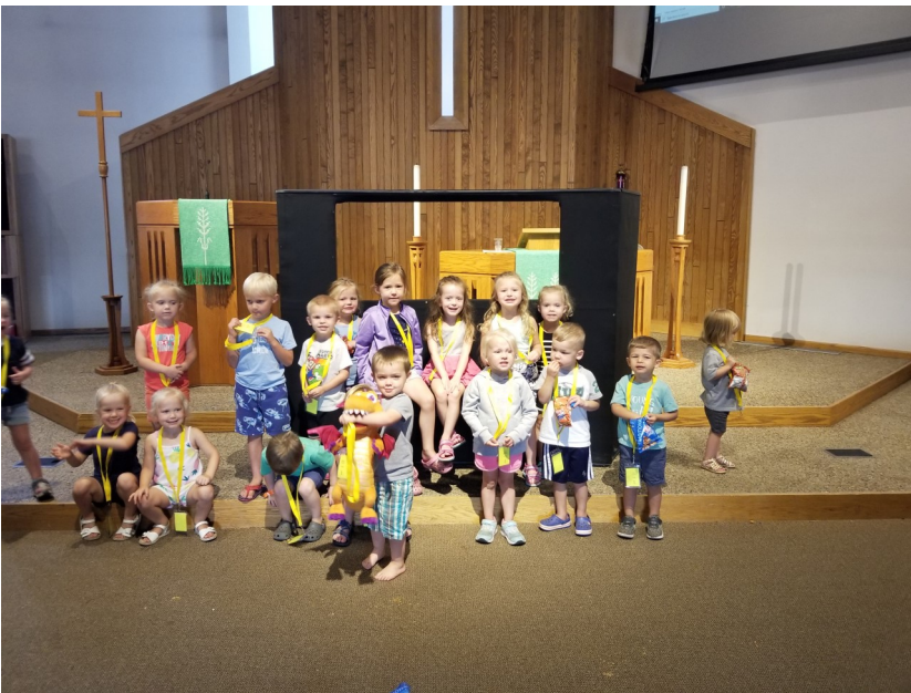
Knights of North Castle VBS