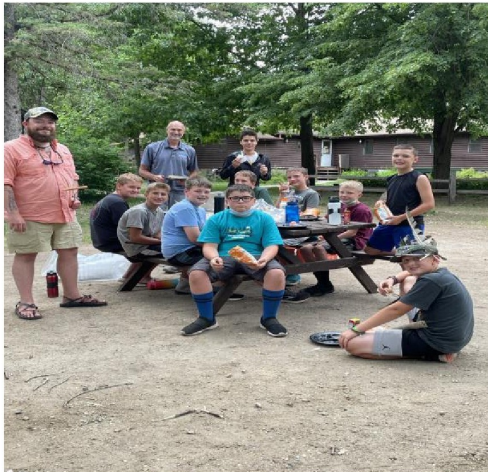
Continue the fun by checking out our fall retreats!

Shetek Lutheran Ministries Where Christ Renews and Empowers