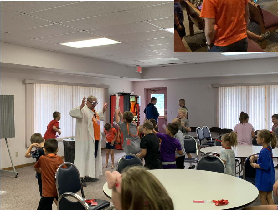
"Dr. Science" at Knights of North Castle VBS