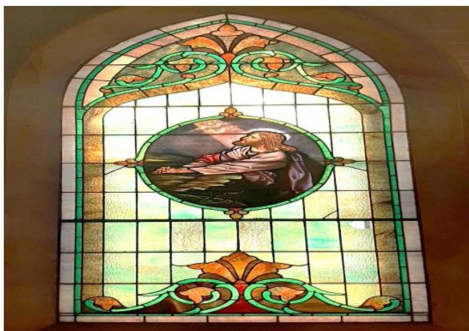
The stained glass window in the chapel will now shine with natural sunlight and also will be lit from behind at night.

Our "Building on the Foundation" capital campaign is restarting after a pandemic pause. So far, we've raised over $1,200,000 in gifts/pledges towards our $1,500,000 goal! More info. on our website. https://shetek.org/slm-master-plan/