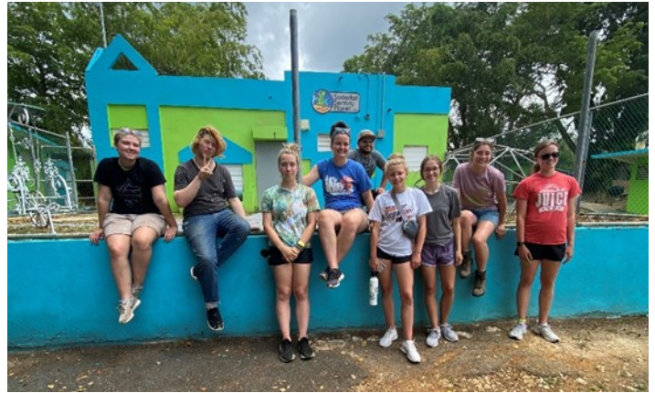
This is the kids camp we painted.