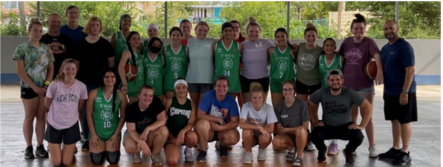
Here is the community basketball game we participated in for one of our fun activities.