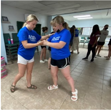
Our evening activity one night of salsa dancing lessons