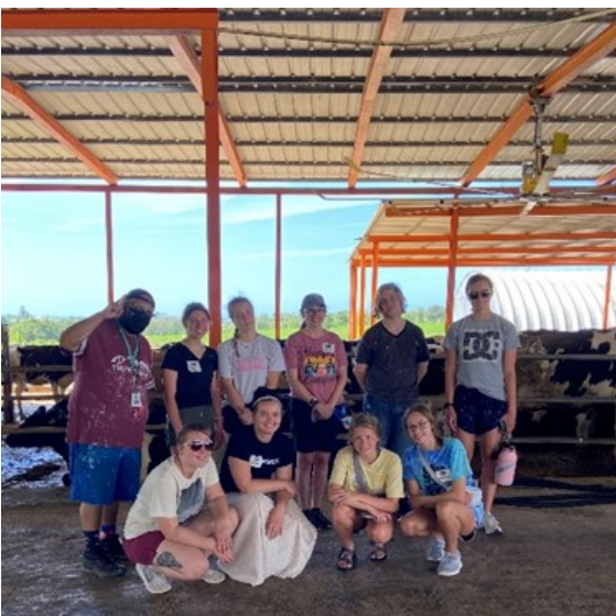
The family that we painted their home was so thankful for our help that they gave us a tour of the dairy that he works at.

Sociedad Sembry Planet Sede www.sembryplanet.org