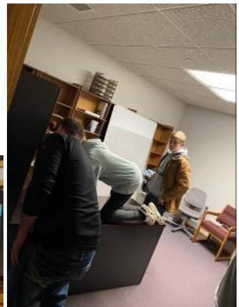
Helping out with getting the new desks set up in the offices