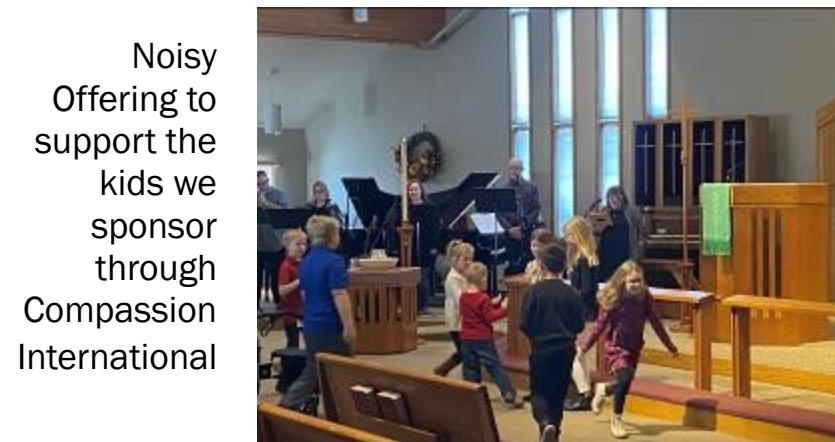
Noisy Offering to support the kids we sponsor through Compassion International