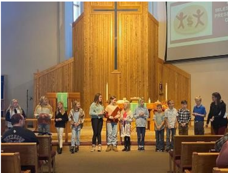
Faith Milestone: Stewardship (5th grade)