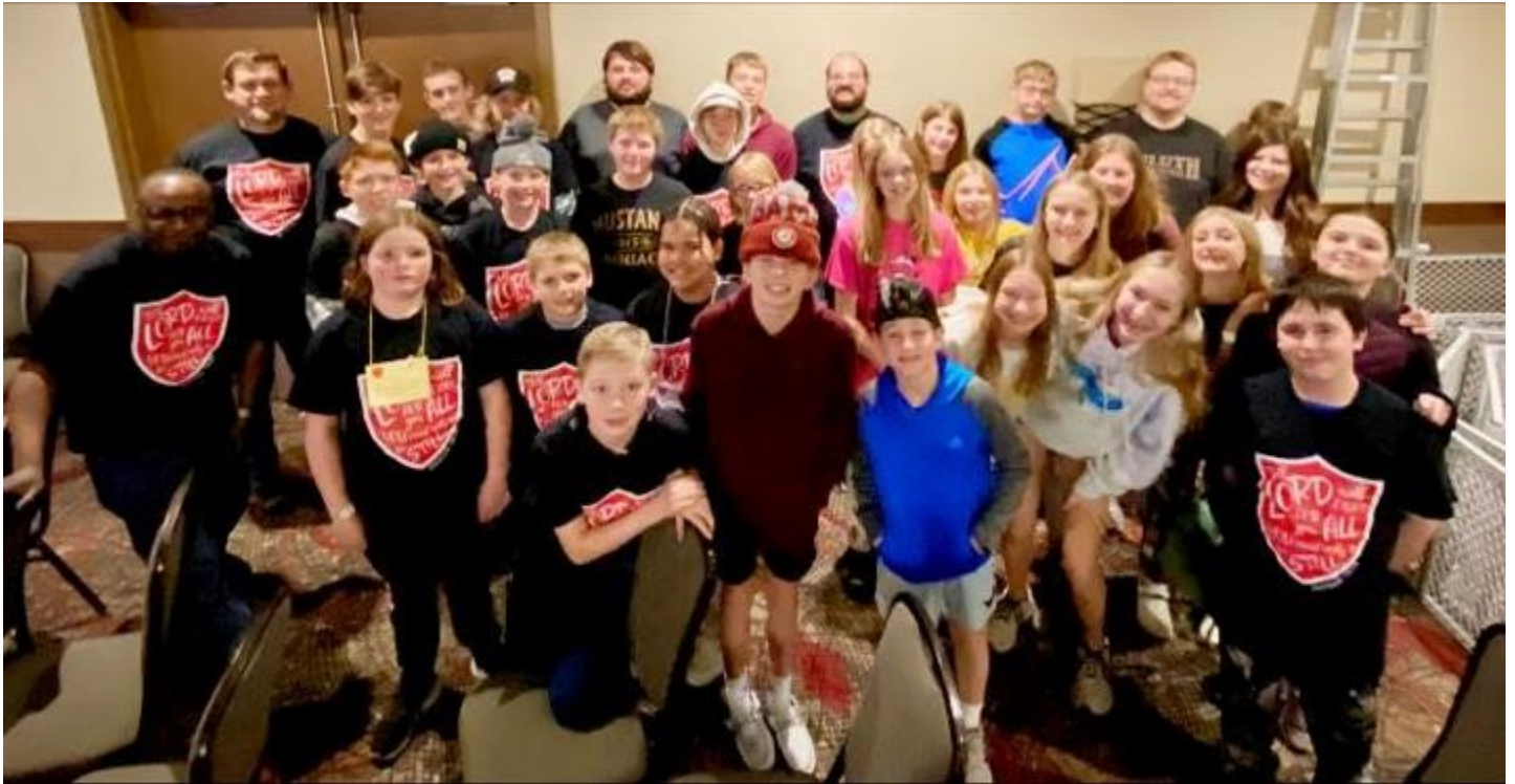
Jr. High Youth Gathering in Willmar—attended by 33 youth and 9 adults