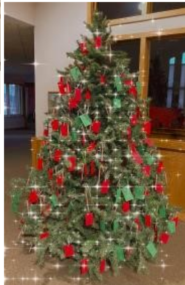
Heart to Heart Tree set up by the Sr. High Youth