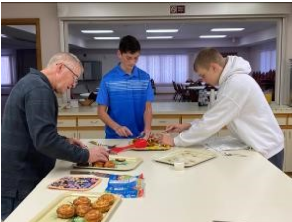
Serving 3rd Sunday Fellowship