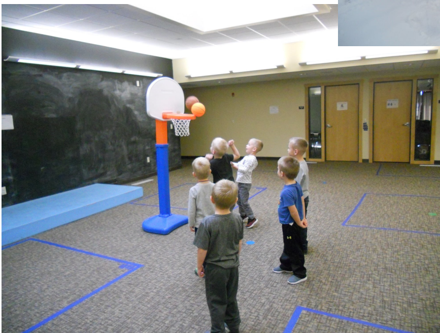
We got a new indoor basketball hoop!