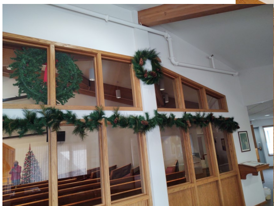
Our Christmas Decorating Committee wasn't stopped by any pandemic!