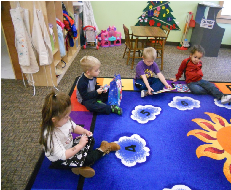
Christmas Book Exchange