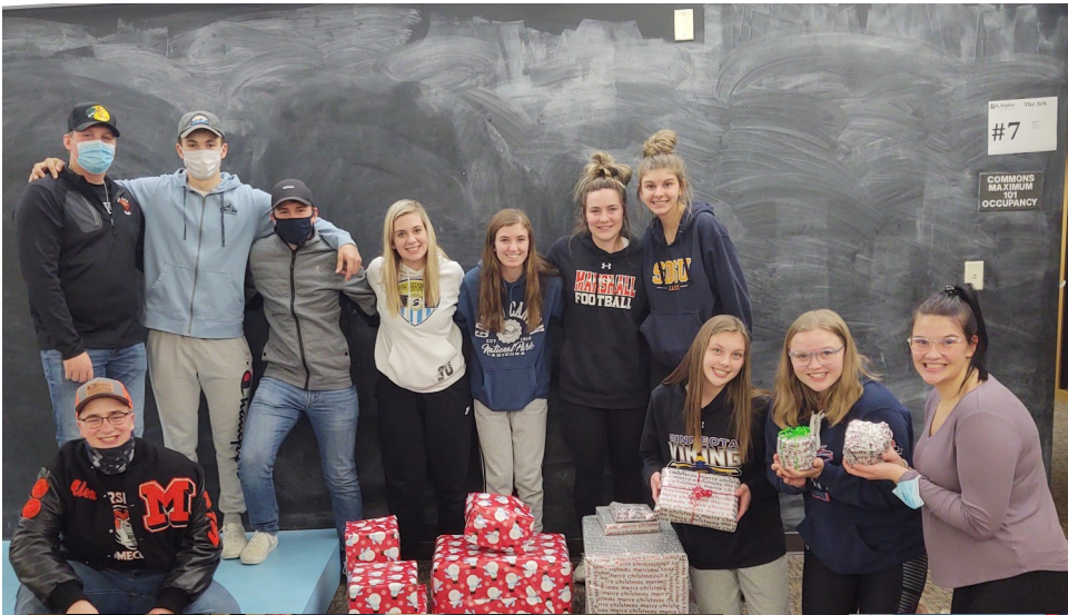
For Christmas, Sr. High Youth/CIA sponsored a family Through New Horizons Community Center.