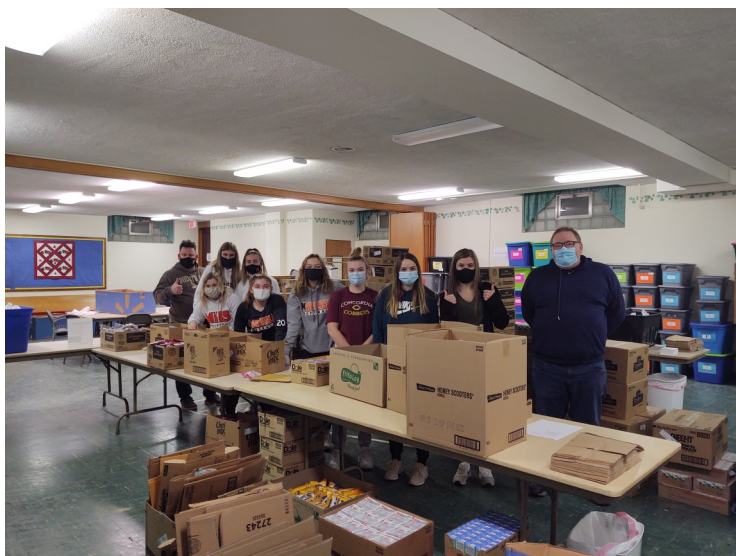
Sr. High Youth/CIA Youth packed for Marshall Food4Kids on December 2nd.