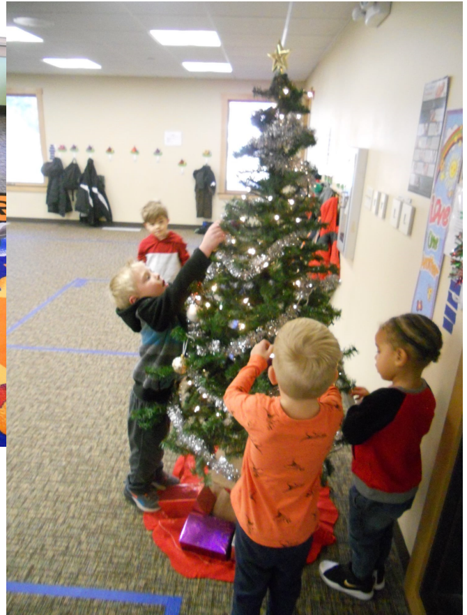
Decorating the Tree