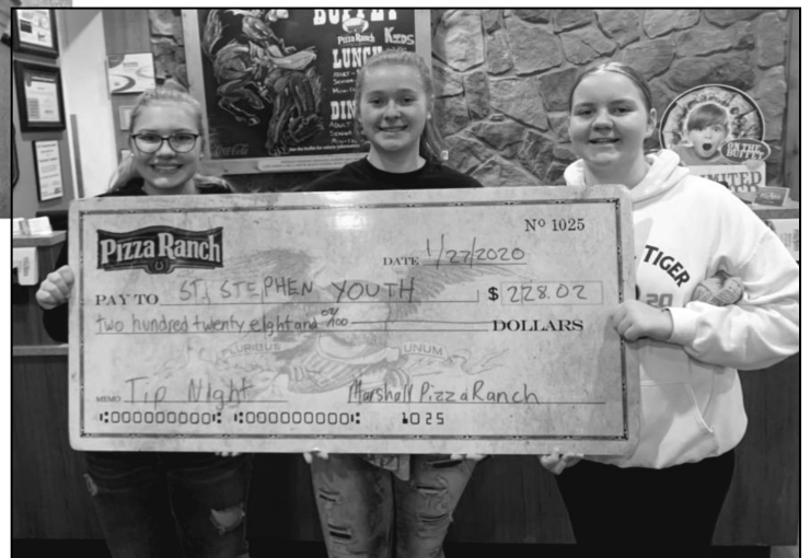
Youth Pizza Fundraiser