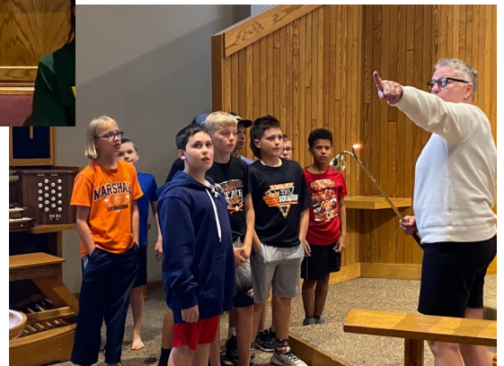
Confirmation students learning their ministry roles (acolyte, projector & assistant)