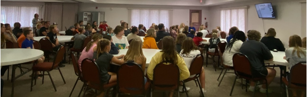
Confirmation large group sessions

Youth programming started on September 14th! The church is full of young people on Wednesday evenings again and it's awesome!