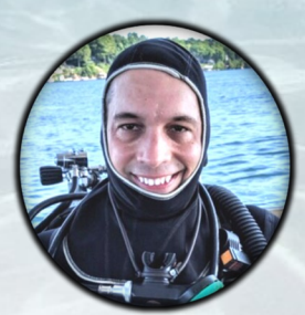
Website: Jim Vafeas