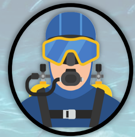
Beach Diving: [Vacant]