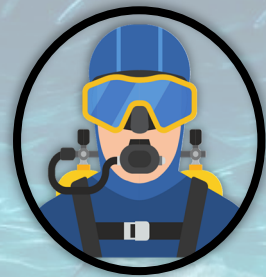
Beach Diving: [Vacant]