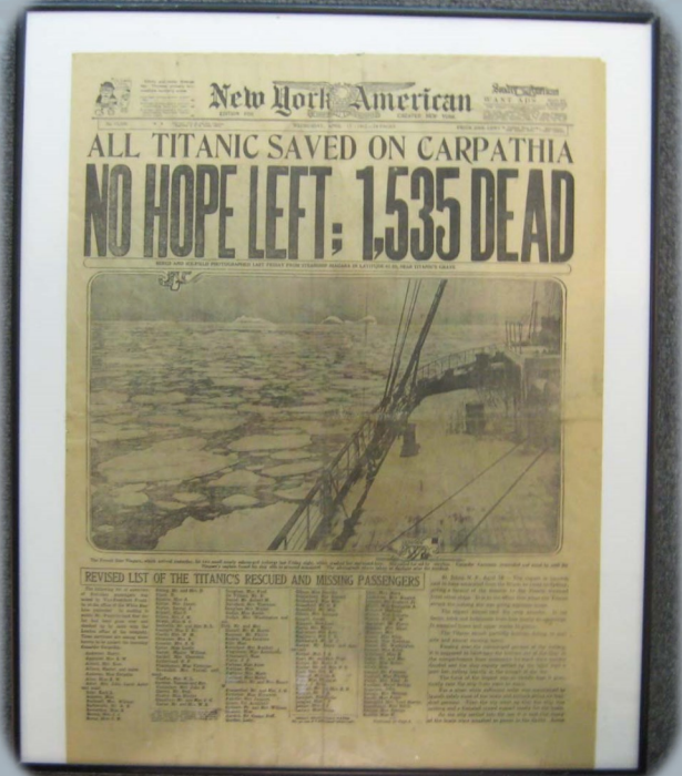
Framed Titanic Newspaper Article (valued at $50)