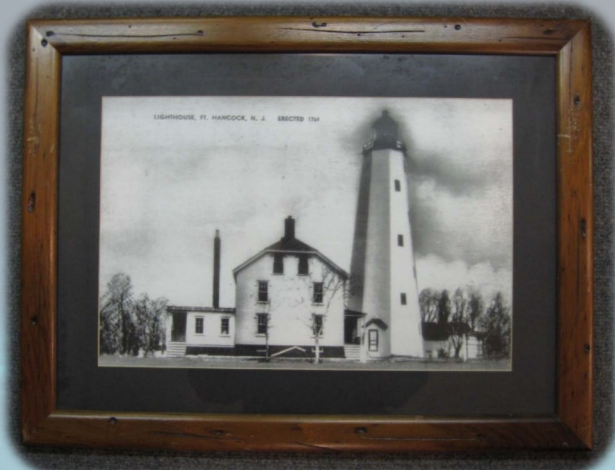
Two Sandy Hook Lighthouse Prints (valued at $75 each)