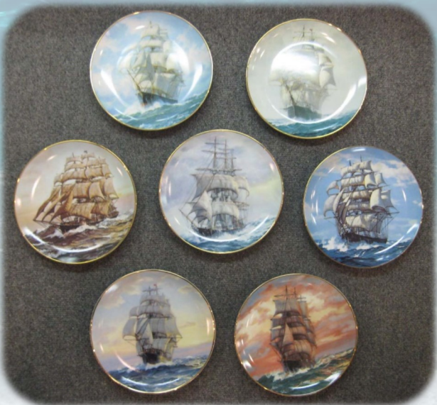
Collectible Plates (valued at $20 - $30 each)