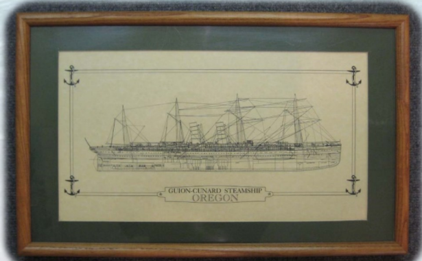
Framed Oregon Print (valued at $30)