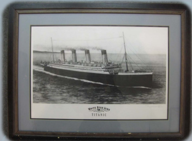
Framed Titanic Print (valued at $200)