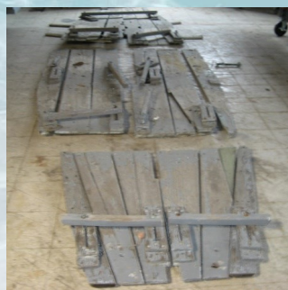
The floorboards reworked, reassembled and installed (viewed from the stern).

Please visit our website to view the status of all our projects. Go to: www.njhda.org