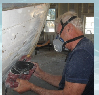
The Monomoy hull primed and ready for topcoat.

The outside of the hull was sanded down, screws tightened or replaced, filled in and primed.