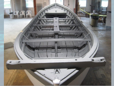
Monomoy Pulling Boat, finished, on its stand, and ready for display!