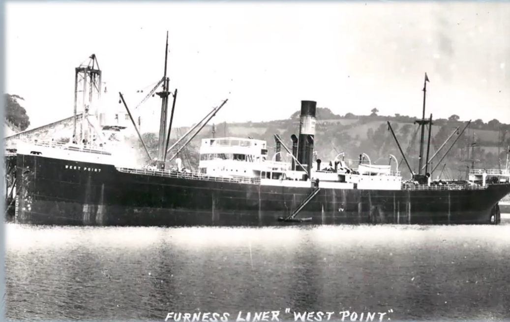
FURNESS LINER "WEST POINT."