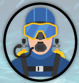
Beach Diving: [Vacant]