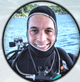
Website: Jim Vafeas