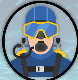
Beach Diving: [Vacant]