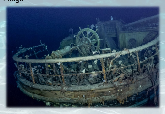
The ship's rear deck and wheel. Its relatively pristine appearance was not unexpected, given the cold water and the lack of wood-eating marine organisms in the Weddell Sea that have ravaged shipwrecks elsewhere.

As the ship became damaged, the crew set up camp on the ice and lived on the ice until it broke up five months after the ship sank. Image