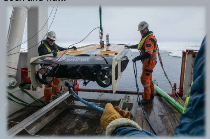
Crew members retrieved an underwater drone after a search.

A video provided by the expedition's organizer, the Falklands Maritime Heritage Trust, showed the bow and portions of the deck and hull.