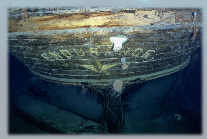
The ship's stern still bore the its name, "ENDURANCE," above a five-pointed star, a holdover from before Shackleton bought the ship, when it was named Polaris.

Explorers and researchers, battling freezing temperatures, have located Endurance, Ernest Shackleton's ship that sank in the Antarctic in 1915