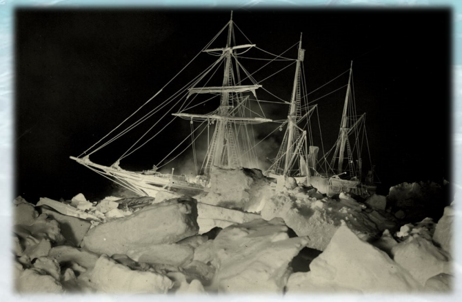
Endurance in 1915, trapped in Antarctic ice but not yet crushed.

The battery-powered submersibles combed the seafloor twice a day, for about six hours at a time. They used sonar to scan a swath of the smooth seabed, looking for anything that rose above it. Once the wreck was located several days ago, the equipment was swapped for high-resolution cameras and other instruments to make detailed images and scans.