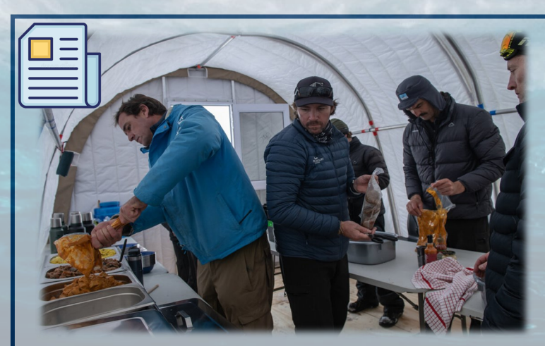
Team members, in a tent on sea ice, prepared a meal on Monday to celebrate the discovery.