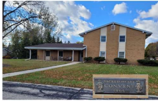
Victory center building, was a CONVENT in 1966

All exhibitors should obtain a copy of the Regulations for Scent Work, by downloading them here: http://images.akc.org/pdf/rulebooks/RSW001.pdf